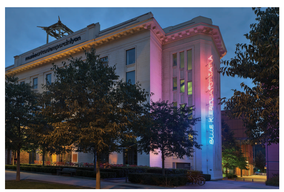
Musée d'art contemporain de Lyon

→ By bike Several vélo'v stations around the Museum Cycle lane from the Rhône's banks to the museum.