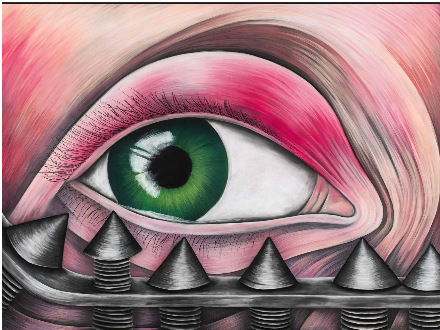
Rebecca Ackroyd, Hard Light , 2023 Gouache, soft pastel on Somerset satin paper - 145 x 184 cm