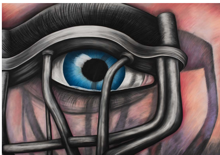
Rebecca Ackroyd, Dusk , 2023 Gouache, soft pastel on Somerset satin paper - 145 x 184 cm

The entire Shutter Speed exhibition reveals the diversity of media used by Rebecca Ackroyd (resin, pastel...) as well as her interest in the fragmentation of the body and temporality.