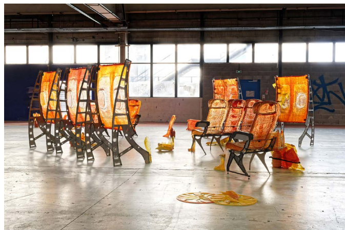
Rebecca Ackroyd, Singed Lids , 2019 Collection macLYON, View of the Lyon Biennale 2019

Her works are mainly sculptures and drawings : "I'm interested in how the two processes differ – it's possible for drawing to be free in a way that sculpture isn't, as it requires more working out – it's always the freedom i'm after." From #legend magazine - Rebecca Ackroyd in conversation with Stephenie Gee , 2022.