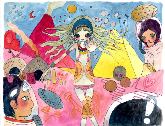
AYA TAKANO, Calendar of Love Vol. 51 We Were Told That We Mustn't Fall in Love with Anyone from This Undeveloped Planet, Earth., 2007 Ballpoint pen and watercolor on paper, 297 x 320 mm

AYA TAKANO is represented by galerie Perrotin.