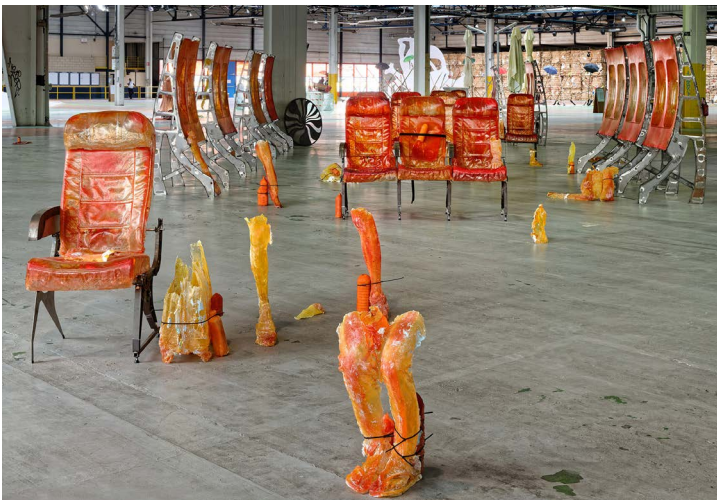
Rebecca Ackroyd, Singed Lids , 2019 Collection macLYON, View of the Lyon Biennale 2019 Courtesy of the artist and Peres Projects, Berlin Photo Blaise Adilon

Matthieu Lelièvre, artistic advisor at macLYON