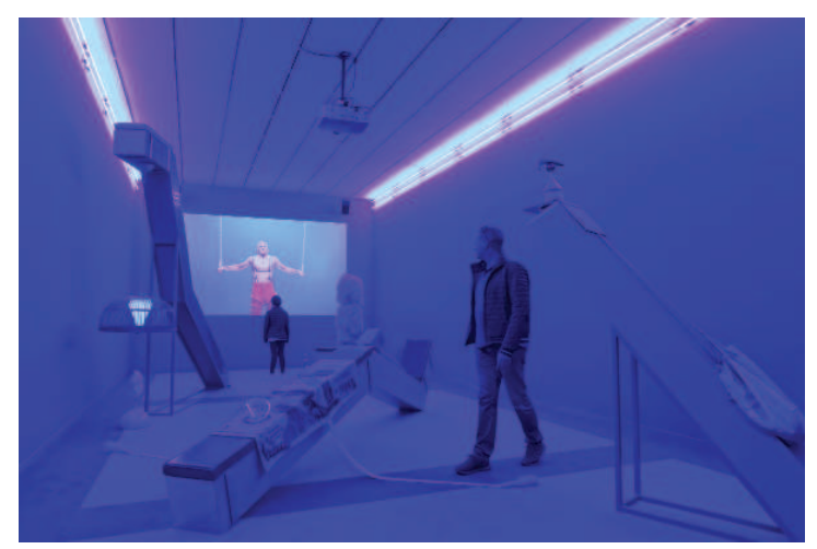
Alex Da Corte, Taut Eye Tau, 2015 Installation Collection macLYON

The first part of this exhibition focuses on the notion of the "body as boundary" (February-July 2023). The second part will focus on the social body (September-December 2023).