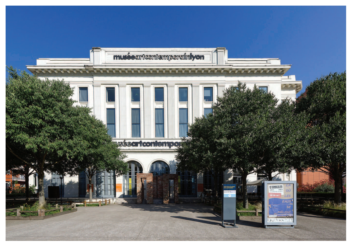
The Musée d'art contemporain de Lyon.

Brought together in an arts pole with the MBA since 2018, the two collections form a remarkable ensemble, both in France and in Europe.