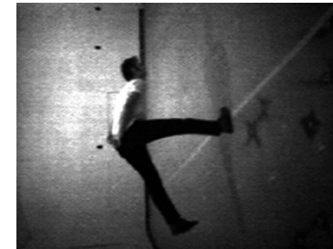
Slow Angle Walk (Beckett Walk), 1968

Bad Boy , 1985 2 , and in 1992 it received Butt to Butt (Large) , 1989, on loan from the FNAC. These important works remained isolated, however, until the museum acquired others: four videos in 1997, and a set of nine pieces, films and videos, in 2008. The same year, during a transfer of property rights by the FNAC, mac LYON became the owner of Butt to Butt (Large) , and also Setting a Good Corner , 1999.