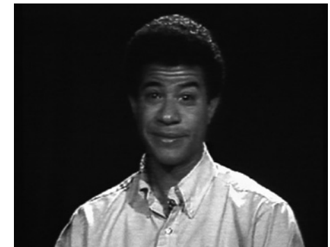
Good Boy Bad Boy, 1985