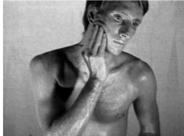
Art Make-Up, No.1, White, N°2, Pink, N°3, Green, N°4, Black, 1967-68

Bruce Nauman is American. Born in 1941, he has been developing a protean oeuvre since 1967. There was an important retrospective of his work at the 2009 Venice biennial. He gives his first priority to ideas, before thinking about their concrete form, which means that he chooses his medium according to the most suitable type of expression: film, video, sculpture, performance, photography or other. Though he shuns publicity, his work has influenced numerous artists. And he has exhibited in Lyon on a number of occasions. The 1995 Lyon biennial, for example, included Rats and Bats (Learned Helpless in Rat II) , 1988, Lived-Taped Video Corridor , 1970, and Video Corridor for San Francisco (Come Piece) , 1969, which were on show at mac LYON . But it has not been possible to produce or acquire a generic work or a moment , and it was through chance events that the museum collected the sixteen works which now form the basis of a generic grouping. In 1989 it acquired the emblematic Good Boy