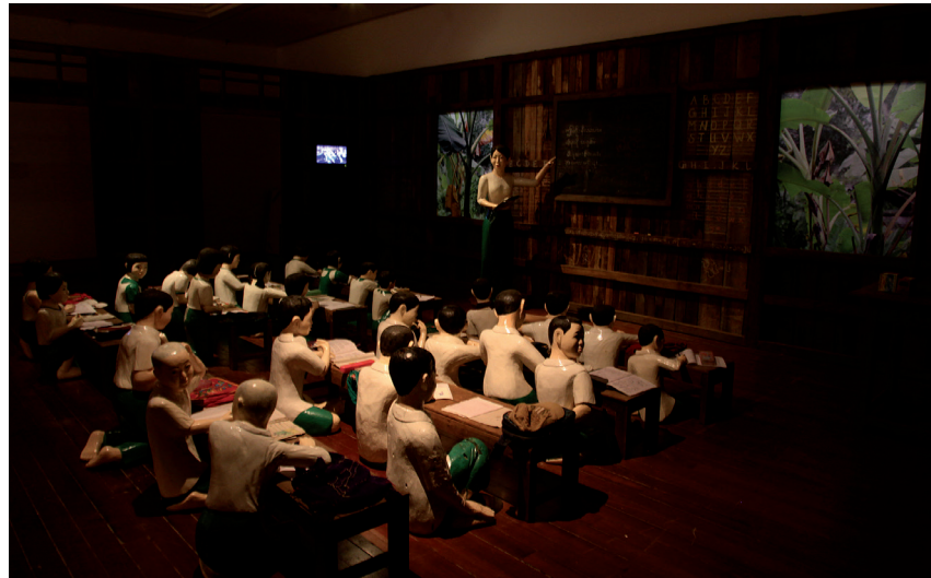
Nge LAY, The Sick Classroom , 2015 Mixed techniques, video, photographs Installation view in the Singapore Biennale 2013 at the Singapore Art Museum Variable dimensions Collection of the artist / Courtesy of the artist

For the 2013 Singapore Biennale, Nge Lay swapped the school materials used by a first year class at the village of Thuye'dan (Myanmar) for new school supplies and backpacks for children, and photographed the teacher and the classroom with its chalk-covered teak walls. She then worked with a local carpenter in order to fully recreate the classroom in sculpted wood (students, teacher and furniture).