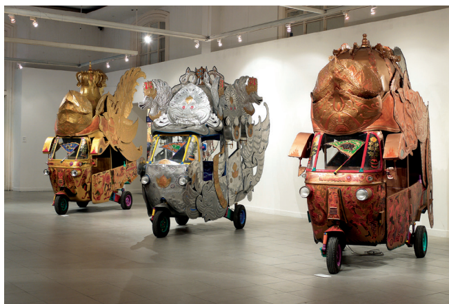
NASIRUN, Bajaj Pasti Berlalu (The Bajaj Will Surely Pass) , 2009–2010 Gold, 2009–2010, Silver, 2009–2010, Bronze, 2009–2010 Mixed techniques, variable dimensions Collection Singapore Art Museum Courtesy GARIS ART

For the 2013 Lyon Biennale, Ming Wong presented Me in Me , which juxtaposes the stories of three women – all played by himself – each living in a different era: 'classical', 'modern' and 'virtual'.