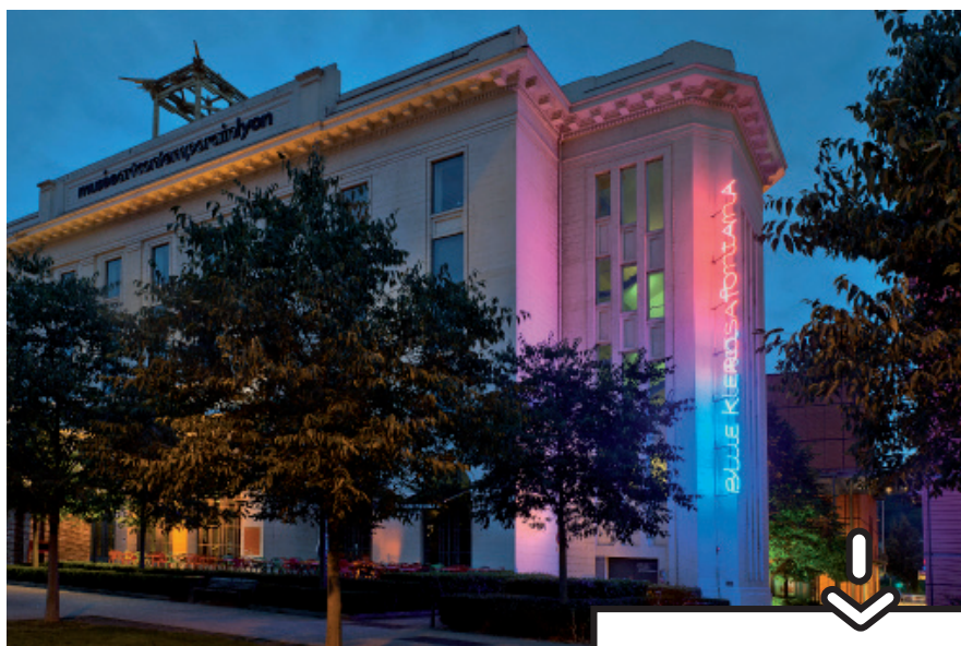
View of the Musée d'art contemporain de Lyon

→ En voiture Along quai Charles de Gaulle, carparks P0 & P2 → ridesharing www.covoiturage-pour-sortir.fr → By bus, stop Musée d'art contemporain Bus C1, Gare Part-Dieu/Cuire Bus C4, Jean Macé/Cité internationale Bus C5, Bellecour/Rillieux-Vancia → By bike Several vélo'v stations around the museum Cycle lane from the Rhône's banks to the museum