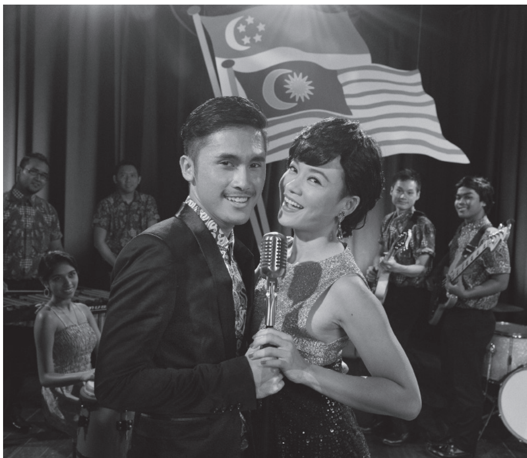
Boo Junfeng, Happy and Free (extrait), 2013 Black & white video 4'02" Collection of the artist

Opening hours: Wednesday to Sunday, from 11am to 6pm