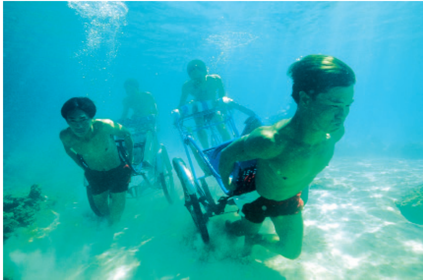
Jun NGUYEN-HATSUSHIBA, Memorial Project Nha Trang, Vietnam: Towards the Complex – For the Courageous, the Curious and the Cowards , 2001 Video, colour, audio, 13', Duration Collection Singapore Art Museum Courtesy of the artist / Collection of the artist

Charles Lim will represent Singapore at the 2015 Venice Biennale International Art Exhibition.