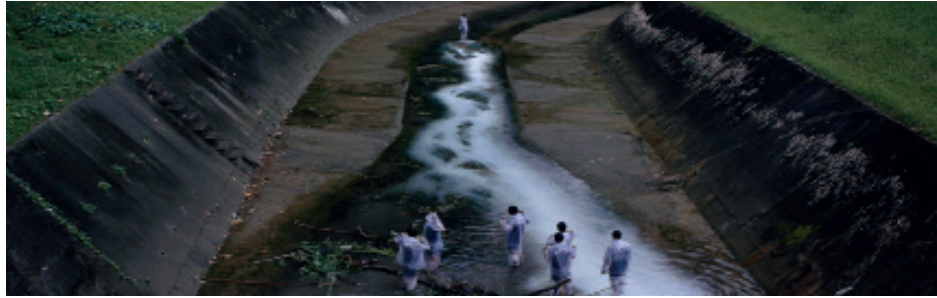
Charles LIM, All Lines Flow Out , 2011 Single-channel HD Video, colour, audio, 21'43" Collection Singapore Art Museum Courtesy of the artist

In 2001, Charles Lim co-founded tsunamii.net, a collective of artists and researchers exploring geography and web communication technology. Their work was exhibited in 2002 at Documenta 11 in Kassel (Germany). An artist and director, he has participated in numerous international film festivals: Tribeca Film Festival in New York, the Venice Film Festival, Edinburgh International Film Festival, etc. In 2013, his project Sea State was selected for the exhibition, Rendez-vous in Lyon.