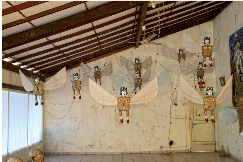
Heri DONO, Female Flying Angels , 2013 Fibreglass, tissue, bamboo, electronics Variable dimensions Collection of the artist / Courtesy of the artist

The series History Class consists of children's desks, engraved by the artist with scenes from Thai history, a reference to the transmission of national history. Amongst the various episodes chosen by the artist are the massacres of 1970, as depicted in press photos, as well as key moments from the 19th and early 20th centuries. These scenes or images can be rubbed onto tracing paper to be taken home.