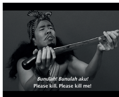
Ming WONG, Four Malay Stories , 2005 4 channel videos, black and white, audio Duration, 4'03" and 25' in loop Collection Singapore Art Museum Courtesy of the artist

Ming Wong was part of a theatre company called Action Theatre in the 1990s. He plays or acts out scenes from famous movies, selected for their iconic nature, thereby creating multimedia installations which explore the excesses of language, performance and intercultural experiences. In Ming Wong's work, film as a means of collective memory becomes a way of linking together notions of gender, representation, culture and identity.