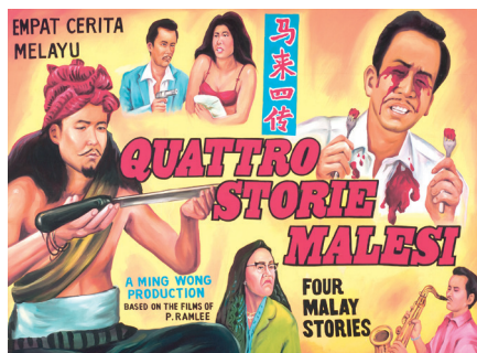
Four Malay Stories , 2009, design by Ming WONG, handpainted by NEO Chon Teck Acrylic on canvas, movie pannel 217,5 × 295 cm Collection Singapore Art Museum