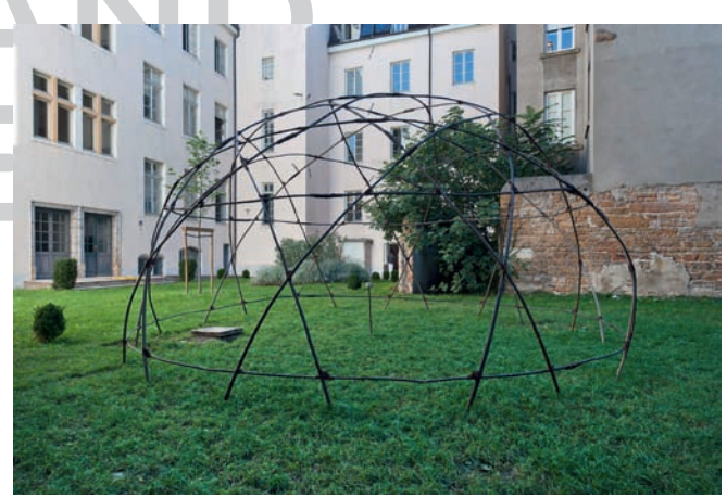
Richard BUCKMINSTER FULLER, Great Circle Dome , 1960 Chestnut and hazel wood, Ø 6m Biennale de Lyon 2011, Courtesy The Estate of R. Buckminster Fuller Collection mac<sup>LyON</sup>

Fuller inspired by his observations of nature. The inventor applies the concept of the geodesic line (the shortest line joining two points on a surface) to construct the most balanced, lightweight and resistant structure possible. His domes are a synthesis of all of the inventor's fundamental precepts, combining a reasoned and aesthetic use of technological progress with a holistic conception of man's relationship to nature. Such was the reputation of the inventor in the scientific domain that a family of carbon-based molecules with a geodesic structure was named after him: Buckminsterfullerenes, later changed to fullerenes. Many of these molecules have played a role in recent nanotechnology discoveries.