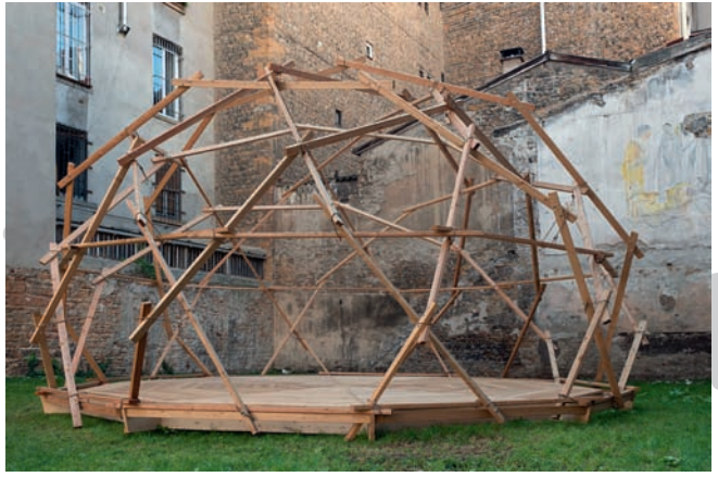
Richard BUCKMINSTER FULLER, Bear Island Dome, 1965 Larch wood, Ø 9m Biennale de Lyon 2011, Courtesy The Estate of R. Buckminster Fuller Collection mac<sup>LYON</sup>

THE MULTI-SKILLED ARCHITECT AND DESIGNER RICHARD BUCKMINSTER FULLER IS ABOVE ALL KNOWN FOR HIS FORWARD-LOOKING VISION OF WORLD PROBLEMS AND THE SOLUTIONS HE PUT FORWARD TO RESOLVE THESE. IN THE 1930s, HE DEVELOPED THEORIES INSPIRED BY AN ONGOING EXCHANGE WITH NATURE, BASED ON HIS OBSERVATIONS AND RESEARCH INTO BALANCE OR EQUILIBRIUM. THIS WORK HAS OFTEN BEEN QUALIFIED AS UTOPIAN. HOWEVER, SOME OF HIS GLOBAL PREDICTIONS HAVE BEEN PROVED CORRECT AND A NUMBER OF HIS SOLUTIONS HAVE BEEN IMPLEMENTED. IN MANY RESPECTS, THE GEODESIC DOME IS HIS MOST FAMOUS INVENTION. THIS DOME DERIVES ITS STRENGTH FROM THE INTERCONNECTED TRIANGLES CLOSED INTO A SPHERICAL SHAPE, AN ARCHITECTONIC FEATURE THAT FULLER SAW REFLECTED IN THE NATURAL WORLD. THE TWO DOMES—NOW PART OF THE MUSEUM'S COLLECTION—HAVE BEEN CONSTRUCTED USING LOCAL MATERIALS IN ORDER TO LIMIT THEIR ENVIRONMENTAL IMPACT AND ARE THE PERFECT EXAMPLE OF FULLER'S WORK.