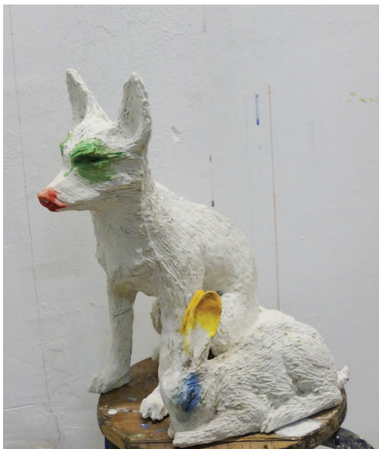
Edi Dubien, Naissance d'une nouvelle nature [Birth of a New Nature] (détail), 2020 Work under creation Epoxy resin, make-up and paint - Fox: 47 × 18 × 40 cm / Rabbit: 23 × 8 × 16 cm Courtesy of the artist and Galerie Alain Gutharc, Paris © Adagp, Paris, 2020