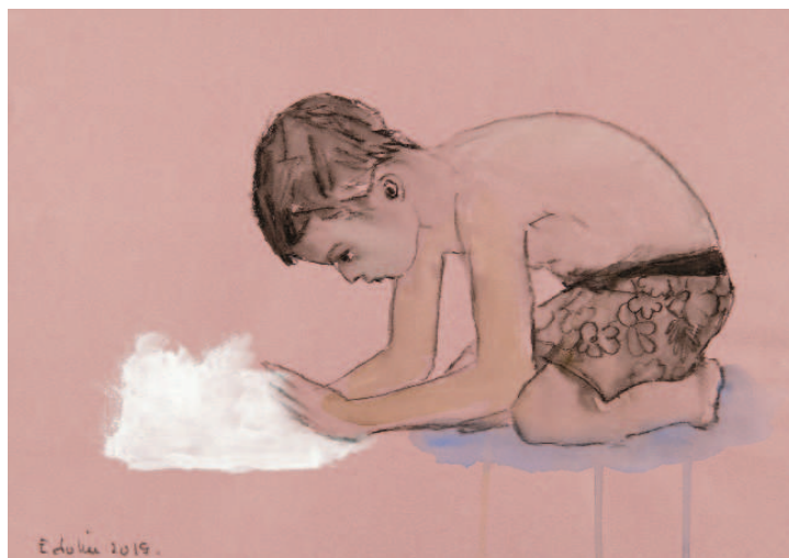
Edi Dubien, Espoir blanc [White Hope] , 2020 Watercolour, ink and pencil on paper 21 x 29,5 cm Courtesy of the artist and Galerie Alain Gutharc, Paris © Adagp, Paris, 2020

Ingrid Luquet-Gad, Les Inrocks , september 2019