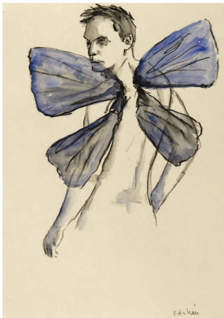
Edi Dubien, Transition , 2020 Watercolour, ink and pencil on paper 29,5 × 20,5 cm

Edi Dubien in Connaissance des arts , 2019