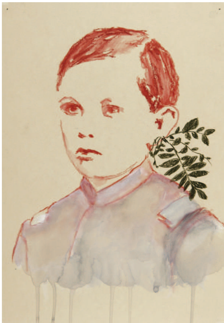
Edi Dubien, Enfant soldat [Child Soldier] , 2019 Watercolour and pencil on paper 29,5 × 20,5 cm

Edi Dubien in Connaissance des Arts , 2019