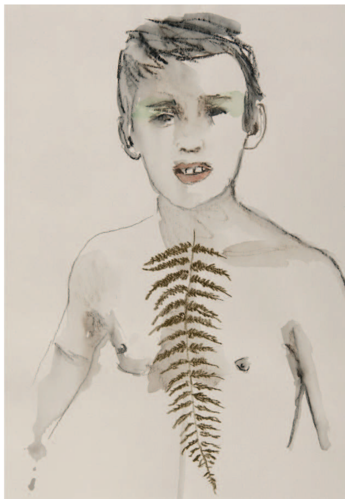
Edi Dubien, Nature libre [ Free Nature ], 2020 Watercolour, ink and pencil on paper 29,5 × 20,5 cm

While each of the works contains a palpable biographical charge, they also question our relationship to the plant and animal ecosystem, an issue central to the artist's personal development and the definition of his own identity. In some drawings, the fern leaf can just as easily evoke a scar as it can a substitute rib cage, thereby symbolizing the body under construction.