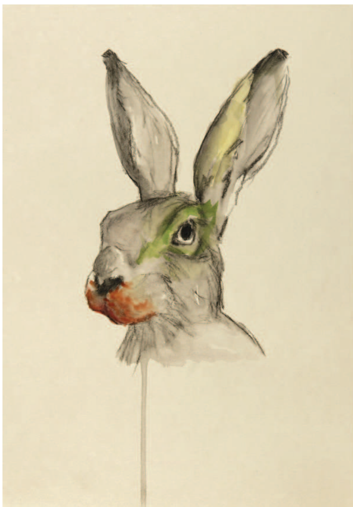
Edi Dubien, Jeune lapin maquillé [Young Rabbit with Makeup] , 2020 Watercolour and pencil on paper 29,5 × 20,5 cm

These animals “express a renaissance, a sense of hope. Trans, because this is my story and because it symbolizes both an openness and a freedom.”