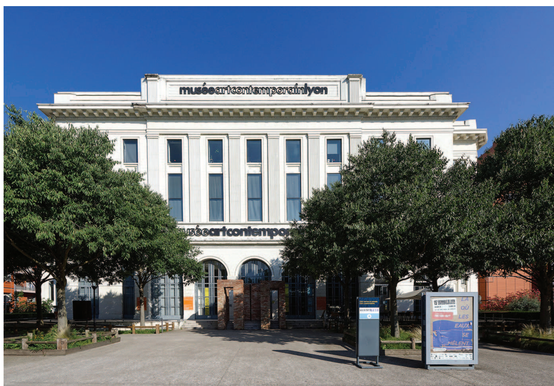
View of the Musée d'art contemporain de Lyon.

Brought together in an arts pole with the MBA since 2018, the two collections form a remarkable ensemble, both in France and in Europe.