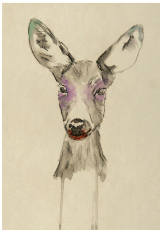
Edi Dubien, Jeune chevreuil maquillé [Young Deer with Makeup] , 2020 Watercolour and pencil on paper 29,5 × 20,5 cm