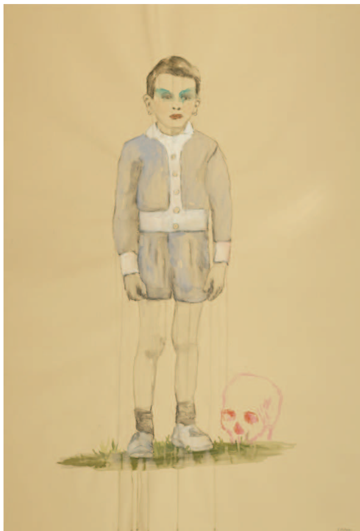
Edi Dubien, Jardin secret [Secret Garden] , 2020 Watercolour, ink and pencil on paper 110 × 75 cm Courtesy of the artist and Galerie Alain Gutharc, Paris © Adapp, Paris, 2020

Julie Crenn, 2017, excerpt from the text of the exhibition catalogue Voyage d’un animal sans mesure , Maison des arts de Malakoff