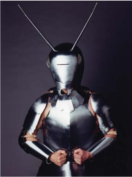
Jan Fabre, Sanguis / Mantis , 2001 Armor used by Jan Fabre for the performance Sanguis / Mantis , 22 may 2001, Subsistances, Lyon