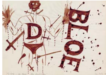
Jan Fabre, Self-portrait as Surgeon , 1978 Series: My Body, My Blood, My Landscape Collection Angelos bvba / Jan Fabre