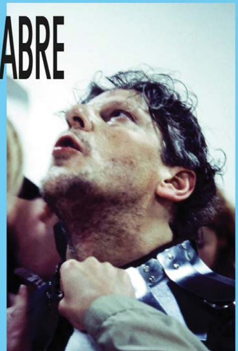
Jan Fabre, Kangas/Mantz, 2001, Courtesy Angewandte Kunst