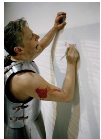
Jan Fabre, Virgin / Warrior , 2004 View of the performance Virgin / Warrior , 14 december 2004, Palais de Tokyo, Paris