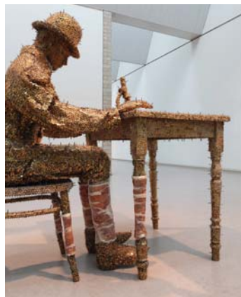
Jan Fabre, Me, Dreaming, 1978 View of the exhibition Jan Fabre. Hortus / Corpus (10 avril - 4 septembre 2011) Collection Museum van Hedendaagse Kunst Antwerp, M HKA, Antwerp (Belgique)

He exhibits at the Fundació Joan Miró, Barcelona and also at the Galleria d'Arte Moderna e Contemporanea, Bergamo (Italy).