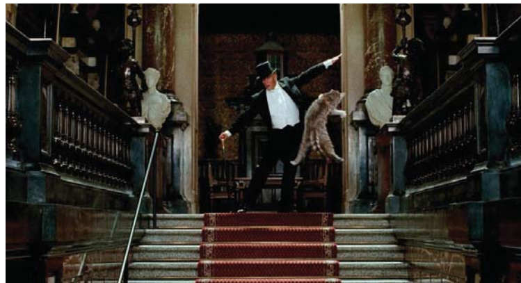
Pierre Coulibeuf Doctor Fabre Will Cure You (2013) 35mm film transferred onto digital file, sound 60 min 10 sec, loop

The film, a modern fairy tale, projects Jan Fabre into his own imaginative universe and composes a character who changes ceaselessly identity, plays numerous roles under the most varied disguises; behind a mask, still another mask... The female character, like a 'demon of passage' using different faces, haunts the male character and inspires his metamorphoses, ad infinitum .