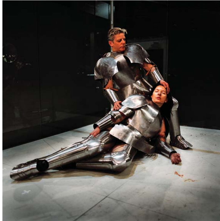
Jan Fabre, Virgin / Warrior , 2004 View of the performance Virgin / Warrior , 14 december 2004, Palais de Tokyo, Paris

JF [...] AS I SAID, I WAS ARTIST-IN-RESIDENCE AT THE NATURAL HISTORY MUSEUM IN LONDON. IN THE BASEMENT OF THE MUSEUM I DISCOVERED A LOT OF THESE OLD DISPLAY CASES FROM THE TURN OF THE NINETEENTH CENTURY. IN QUITE A SMART MOVE, WHEN I NEGOTIATED MY SALARY OVER THERE I MADE THEM PAY PART OF MY SALARY IN THESE BEAUTIFUL OLD DISPLAY CASES. (CHUCKLES.) SO THE DISPLAY CASE THAT WE USED IN THE VIRGIN / WARRIOR PERFORMANCE WAS BASED ON THE DIMENSIONS AND MATERIALS OF THESE OLD DISPLAY CASES. FOR FIVE HOURS MARINA AND I WERE PERFORMING AS TWO RARE ENTOMOLOGICAL SPECIMENS.