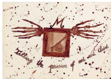
Jan Fabre, Telling the Passion of Art and Christ , 1978 Series: My Body, My Blood, My Landscape Collection Angelos bvba / Jan Fabre Courtesy Angelos bvba © Adagp, Paris 2016