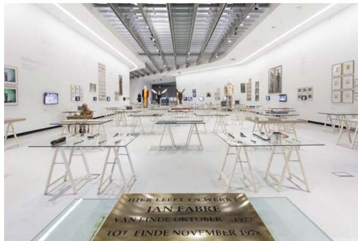
View of the exhibition JAN FABRE – STIGMATA – Actions & Performances 1976-2016, MAXXI, Roma, 16 october 2015 - 16 february 2014

The mise en scene for this exhibition is by Jan Fabre and Germano Celant. It presents an overview of all his performances and actions. 'THE BEST WAY I CAN EXPRESS THE SCENOGRAPHY AND MATRIX OF THE EXHIBITION: FIRST WE DECIDED ON THE LANDSCAPE, THE TABLES WITH PHOTOGRAPHS, ARTICLES AND THINKING MODELS, SECOND WE PLACED THE TREES, THE SCULPTURE-COSTUMES, IN THE LANDSCAPE, AND THE THIRD STEP WAS CREATING THE HORIZON, THE WALLS WITH THE QUOTATIONS FROM MY NIGHT DIARY, DRAWINGS, PHOTOGRAPHS AND SCREENS.'