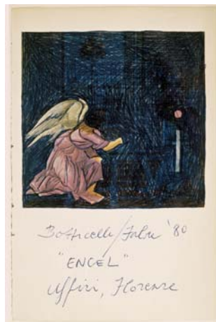
Jan Fabre, Historical Wounds ( Ilad of the Bic-Art ), 1980 Collection Museum zu Allerheiligen, Schaffhausen (Swiss)