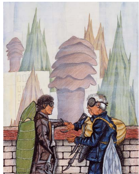
Jan Fabre, A Meeting / Vstrecha (The Mystery of Art) , 1997 Courtesy Angelos byba © Adagp, Paris 2016

GC A YEAR LATER YOU DID THE PERFORMANCE FOR FILM A MEETING / VSTRECHA (1997) WITH ILYA?