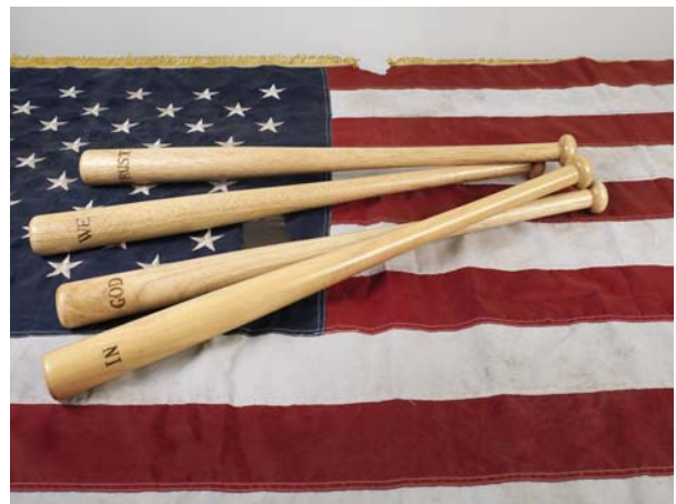
Jan Fabre, American Works and Window Performance , 1980 Photo: Lieven Herreman Courtesy Angelos bvba © Adagp, Paris 2016

JF I HAD BROUGHT A LOT OF CANS OF CAMPBELL SOUP BACK FROM AMERICA IN MY SUITCASE. IN FRONT OF THE GALLERY I CREATED A LITTLE BIT OF THE ATMOSPHERE OF THE FAMOUS STUDIO 54. I PLACED ROPES AT THE ENTRANCE AND POSITIONED FOUR BOUNCERS, NIGHTLIFE FRIENDS, EACH WITH A BASEBALL BAT. ON THE FOUR BASEBALL BATS I HAD ENGRAVED 'IN GOD WE TRUST' AND THESE GUYS WERE SELECTING THE PEOPLE WHO COULD COME INSIDE TO VISIT THE EXHIBITION. WHEN YOU WERE SELECTED YOU RECEIVED A JAWBREAKER, MY 'MAGIC BALL' WITH A WORM INSIDE. SO THE ATMOSPHERE OF THE OPENING WAS SLIGHTLY HALLUCINATORY. (CHUCKLES.) IN THE MEANTIME I WAS SITTING IN THE WINDOW AND EATING A LOT OF PEANUTS, ACTING LIKE A MONKEY AS A REFERENCE TO THE AMERICAN PRESIDENT JIMMY CARTER. AND I WAS ALSO BEHAVING LIKE A PROSTITUTE, WRITING DIRTY PHRASES ON THE WINDOW WITH LIPSTICK, SUCH AS 'ENERGETIC MIMBOS' (NEW YORK SLANG FOR HOT BABES), AND POETIC PHRASES SUCH AS 'THE GREATEST NATION IS IMAGINATION'. DURING THE EVENING I MADE HUNDREDS OF LIPSTICK DRAWINGS ON PAPER. THIS PERFORMANCE WAS AN ANSWER TO THE AMERICAN SUPERFICIAL STATE OF MIND, EVERYTHING IN AMERICA IS ABOUT THE SURFACE.'