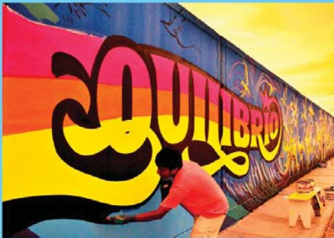
Elliot Tipton, Equilibrio , Balneario Huancho, Trujillo (Perou), 2012

Informations au 04 72 69 17 17 et sur www.mac-lyon.com