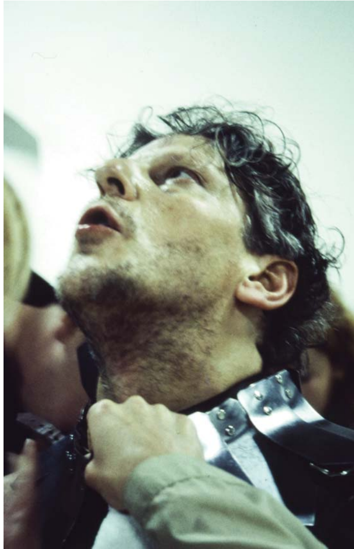
Jan Fabre, Sanguis / Mantis , 2001 View Sanguis / Mantis performance. 22 May 2001, Subsistances, Lyon Photo: Maarten Vanden Abeele Courtesy Angelos bvba © Adagp, Paris 2016

EXHIBITION STIGMATA – ACTIONS & PERFORMANCES 1976-2016 => 30.09.16 - 15.01.17 PERFORMANCE ON 29.09.16 WITH EDDY MERCKX AND RAYMOND POULIDOR