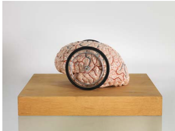
Jan Fabre, Stephen, 2014

JF I MADE THE FIRST BRAIN MARBLE IN 2007. YOU SEE AN ANATOMICAL FIGURE DIGGING INSIDE OF THE HUMAN BRAIN WITH A GOLDEN SPADE. THE NAME OF THE SCULPTURE IS ANTHROPOLOGY OF A PLANET , WHICH WAS ALSO THE TITLE OF MY EXHIBITION IN THE PALAZZO BENZON AT THE VENICE BIENNALE. BESIDES A SERIES OF BRAIN DRAWINGS I ALSO PRESENTED FOUR GLASS JARS EACH ONE CONTAINING A CORAL STONE THAT LOOKED LIKE A HUMAN BRAIN. THE TITLE OF THE WORK IS EINSTEIN, GERTRUDE STEIN, WITTGENSTEIN AND FRANKENSTEIN (2007). THE FOUR CORNERSTONES OF OUR MODERN THINKING: SCIENCE, ARTS, PHILOSOPHY AND ARTIFICIAL INTELLIGENCE. ON THE OCCASION OF THIS EXHIBITION I GAVE THE WORLD PREMIERE OF IS THE BRAIN THE MOST SEXY PART OF THE BODY? (2007, No. 86), THE FILM I MADE TOGETHER WITH EDWARD O. WILSON.