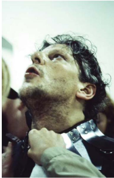
Jan Fabre, Sanguis / Mantis , 2001 View of the performance Sanguis / Mantis . 22 may 2001, Subsistances, Lyon

GC CAN YOU TELL ME SOMETHING ABOUT THE SANGUIS / MANTIS PERFORMANCE?