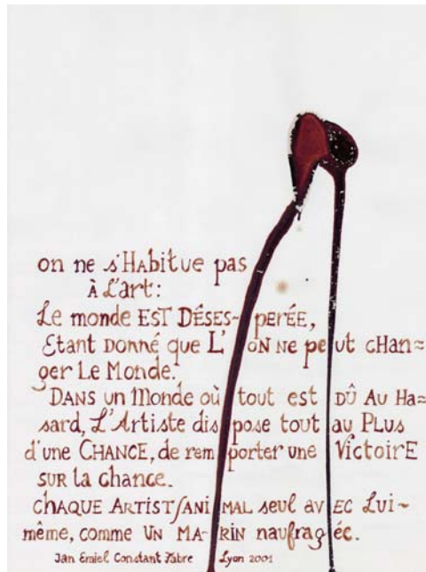
Jan Fabre, On ne s'habitue pas à l'art , 2001 Drawing with blood on paper made during the performance Sanguis / Mantis , 22 may 2001, Subsistances, Lyon

JF NO, WHAT HAPPENED, IT WAS A LITTLE BIT STUPID OF ME NOT TO HAVE FORESEEN IT: BECAUSE OF BREATHING INSIDE THE HELMET FOR HOURS AT A TIME THE METAL GOT RUSTY AND BY INHALING THIS RUST I WAS POISONING MYSELF AND FAINTED.'