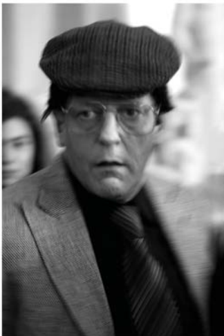
Jan Fabre, ART KEPT ME OUT OF JAIL (HOMAGE TO JACQUES MESRINE), 2008

JF FOR THIRTY YEARS THE OBJECT AND THE SUBJECT OF MY EXPLORATIONS HAS BEEN THE HUMAN BODY, AND OF COURSE IN RECENT YEARS MY EXPLORATION OF THE HUMAN BRAIN HAS GROWN OUT OF THAT. YES, FOR ME THE BRAIN IS THE SEXIEST PART OF THE BODY.'