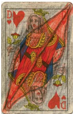
Jan Fabre, Art as a Gamble, Gamble as an Art, 1981