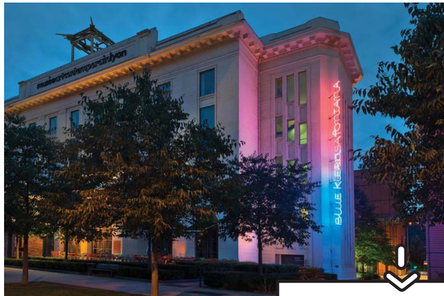
View of the Musée d'art contemporain de Lyon