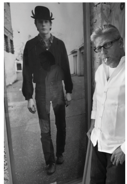
Portrait of Jan Fabre next to « Doctor Fabre Will Cure You »

Jan February is officially invited to St Petersburg to Jan Fabre. Knight of Despair / Warrior of Beauty , a wide-ranging solo exhibition at the Hermitage Museum. On 29 September, Jan Fabre performs ' An attempt to not beat the world hour record set by Eddy Merckx in Mexico City in 1972 (or how to remain a dwarf in a land of giants) ', at the Vélodrome Georges Prével in the Parc de la Tête d'Or, Lyon.