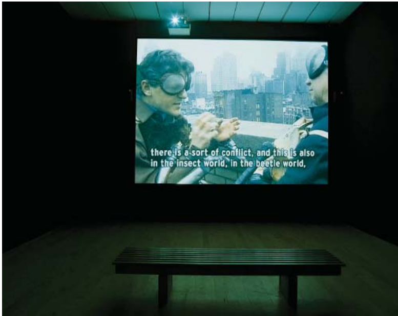
Jan Fabre, A Meeting / Vstrecha , 1997 View of the exhibition Gaude succurrere vitae in mac LYON , 17 september to 19 december 2004 Collection mac LYON Photo: Blaise Adilon © Adagp, Paris 2016