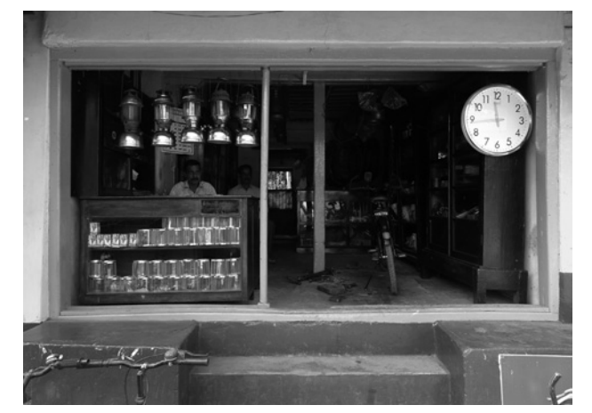
Studio Mumbai Architects & Michael Anastassiades Bicycle Shop, 2010 Proposal for the macLYON Courtesy Studio Mumbai Architects & Michael Anastassiades © Studio Mumbai Architects

IN LYON, INDIAN HIGHWAY IV-SEASON 2, EPISODE 4 OF THE SERIES—THE MACHINE GOES INTO OVERDRIVE, WITH 2,000 M<sup>2</sup> OF EXHIBITION SPACE ON 2 LEVELS, AND WORKS BY 31 ARTISTS: PAINTINGS, SCULPTURES, INSTALLATIONS, PERFORMANCES, VIDEOS, AND AN "EXHIBITION WITHIN THE EXHIBITION" FEATURING A RECENTLY-ESTABLISHED ARCHITECTURAL PRACTICE, STUDIO MUMBAI ARCHITECTS.