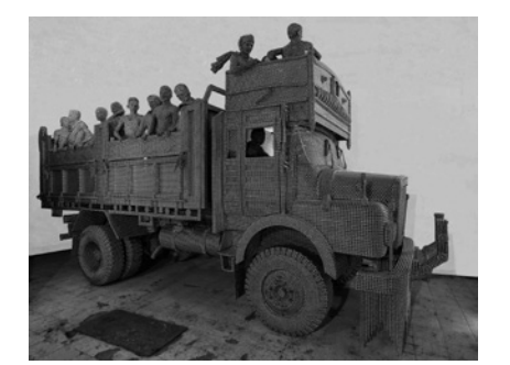
Valay Shende Transit, 2010 Stainless steel, iPad screens 365.8 x 271.8 x 701 cm Courtesv Sakshi Gallerv. Bombav © Anil Rane