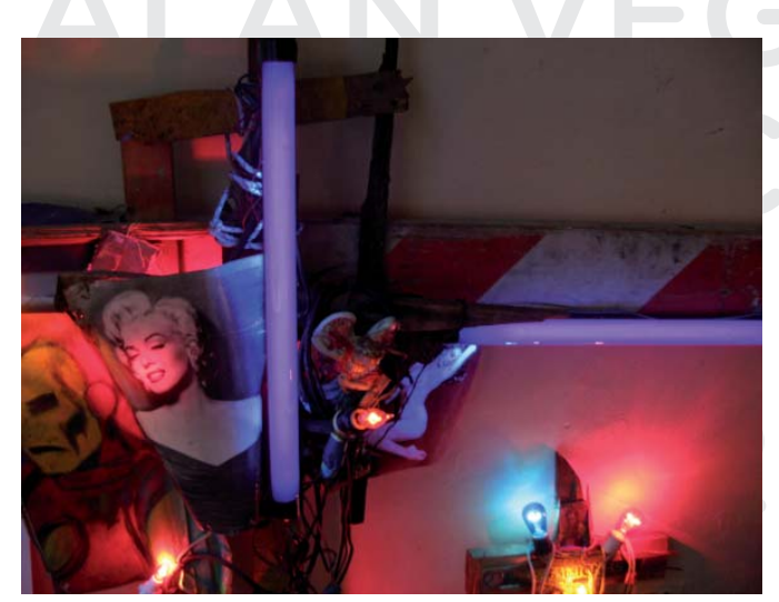
Alan Vega, Iron Man (détail), 1983