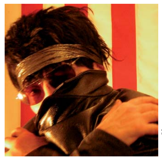
Alan Vega

A generously illustrated catalogue, including various interviews with Alan Vega and close artists, will be edited for the exhibition.