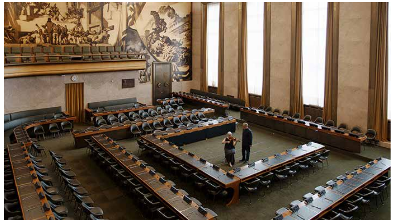
Jasmina Cibic, The Gift , 2021 [film still] Three-channel HD colour video, stereo Courtesy of the artist © Adagp, Paris, 2021