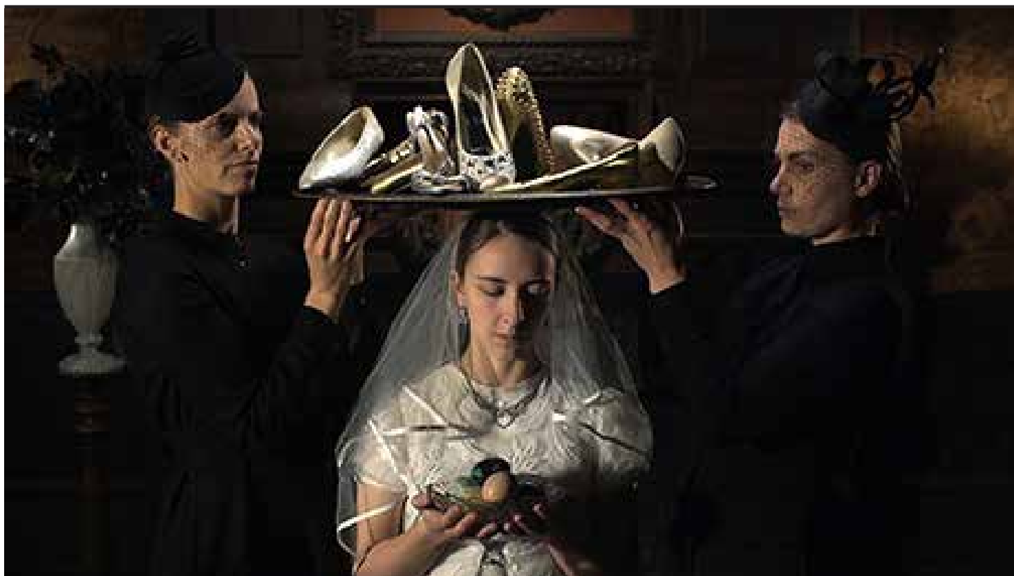
Delphine Balley, Le Temps de l'oiseau , 2020 [Film still] HD colour video, sound

Delphine Balley has spent more than twenty years developing her expertise in photography and video. The exhibition Figures de cire [Wax Figures] is conceived as a journey into time and the vernacular. It is a narrative ensemble consisting of three screenings, Le Pays d'en haut [The Land Above] , Charivari [Hullabaloo] and Le Temps de l'oiseau [The Time of the Bird] , as well as a series of photographic prints and a sculpture. By adopting the hermetic atmosphere of family portraits and the tradition of genre painting, Delphine Balley creates a portrait of universal human stiffness, in keeping with the exposure time needed for a view camera. She establishes relationships between vibrancy and fixity, formlessness and stability, truth and falsehood. Figures de cire [Wax Figures] probes the dysfunctional nature of rites and social representations and invites visitors to take their place in the procession, in a fictitious symbolic architecture and an incomplete narrative, in which marriage and funeral ceremonies merge. Delphine Balley tells a story of appearance and disappearance, the cycle of a life whose motifs and relics survive the passage of time.