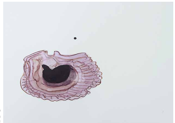
Christine Rebet, Sea , 2020 Ink on paper, 24 x 32 cm