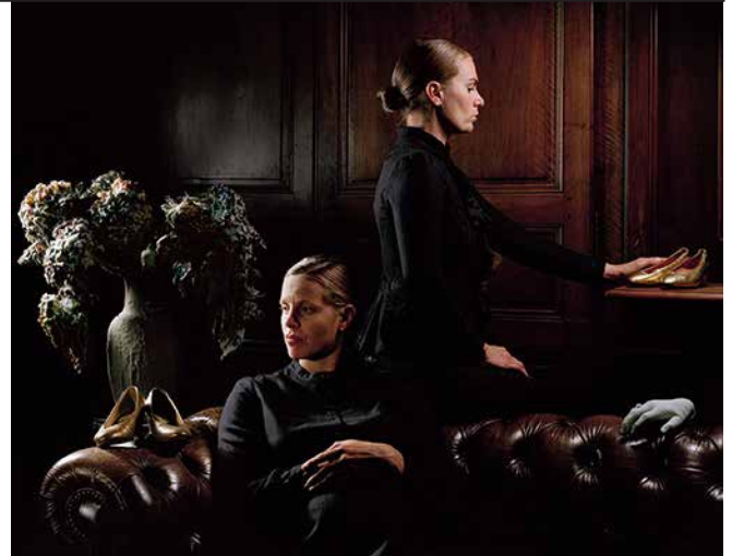
Delphine Balley, Faire les morts , 2019 Camera photography, inkjet print on fine art paper from film-shot- 110 x 140 cm

When visiting these exhibitions, the public will also be invited to discover a series of works selected from the macLYON collection, as well as to take part in various meetings, performances and screenings, all devoted to women artists that macLYON is keen to raise awareness of by giving them greater visibility.