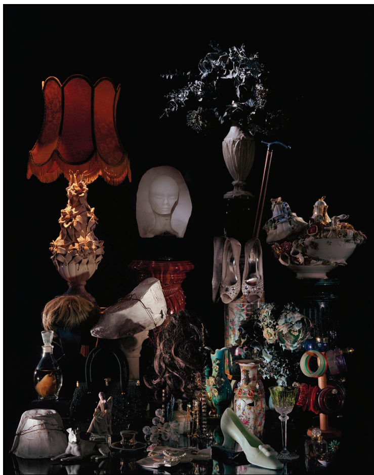
Delphine Balley, Étude , 2021 Figures de cire series Camera photography, inkjet print on fine art paper from a plan-film on dibond 140 × 110 cm