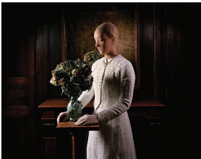
Delphine Balley, L'Enfant transparent, les larmes de cire , 2019 Figures de cire series Camera photography, inkjet print on fine art paper from a plan-film on dibond 110 × 140 cm