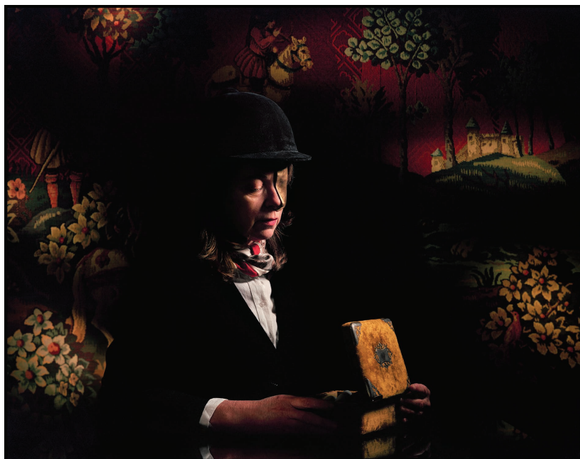
Delphine Balley, Les Reliques , 2021 Figures de cire series Camera photography, inkjet print on fine art paper from a plan-film on dibond 110 × 140 cm

In the exhibition, the artist switches from representation of the human body to the object.