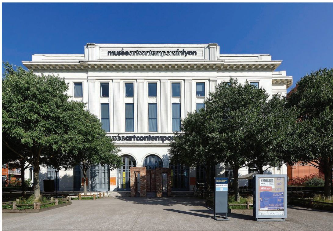
View of the Musée d'art contemporain de Lyon.

Brought together in an arts pole with the MBA since 2018, the two collections form a remarkable ensemble, both in France and in Europe.