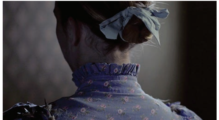
Delphine Balley, Le Temps de l'oiseau , 2021 [Film still] HD colour video, sound, 17'32"

Le Temps de l'oiseau explores rites of passage and social performances, such as the ceremony of mourning and the preparations for it. Delphine Balley draws the portrait of a family rigidity, creating a lacunar narrative in which the ceremonies of the marriage and the funeral merge.