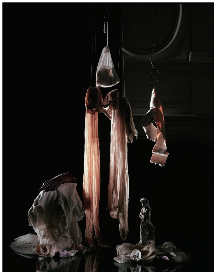
Delphine Balley, Portrait sur le vif , 2021 Figures de cire series Camera photography, inkjet print on fine art paper from a plan-film on dibond 140 × 110 cm