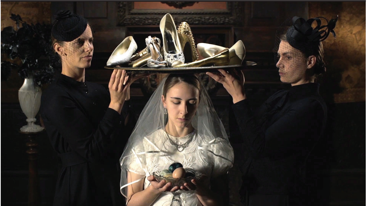
Delphine Balley, Le Temps de l'oiseau , 2021 [Film still] HD colour video, sound, 17'32"

Musée d'art contemporain Cité internationale 81 quai Charles de Gaulle 69006 LYON – France T +33 (0)4 72 69 17 17 F +33 (0)4 72 69 17 00 info@mac-lyon.com www.mac-lyon.com