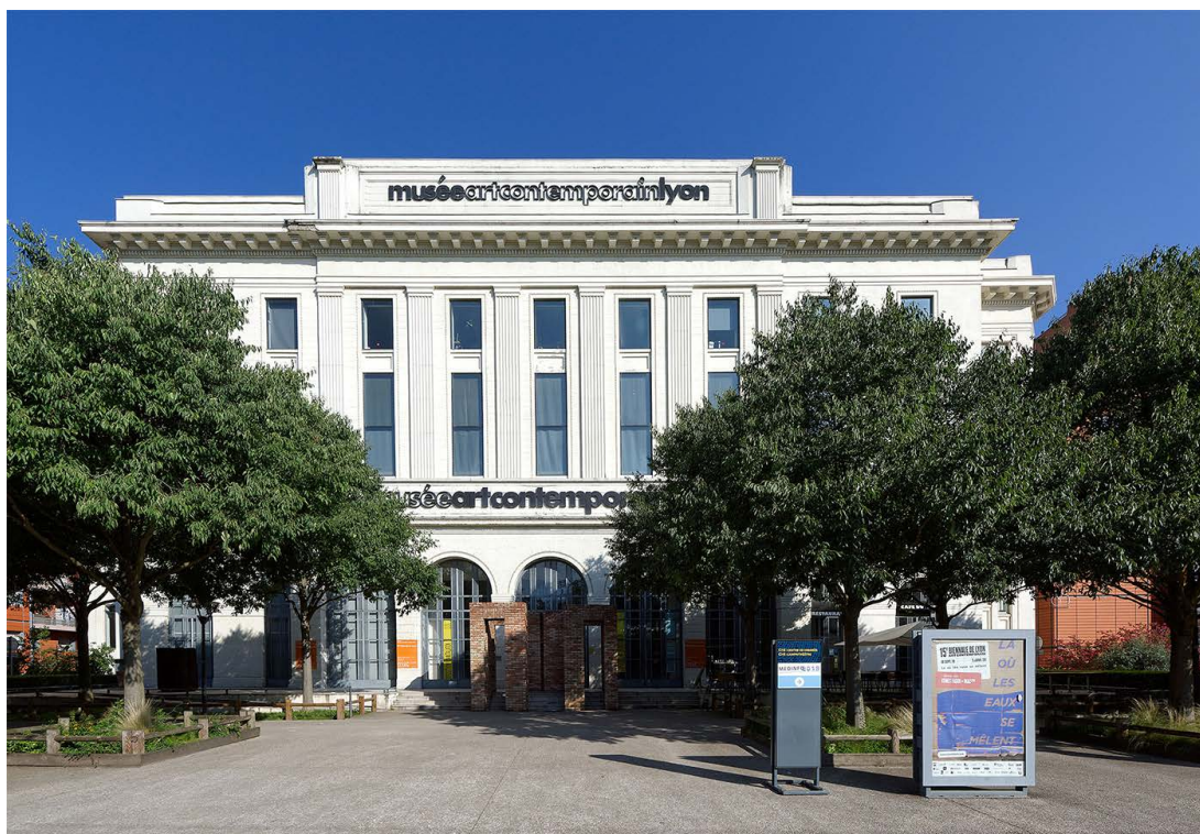
View of the Musée d'art contemporain de Lyon.

Brought together in an arts pole with the MBA since 2018, the two collections form a remarkable ensemble, both in France and in Europe..