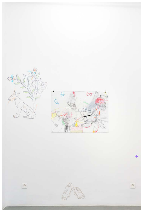
Exhibition's view: Walking Targets , Selma Feriani Gallery, Tunis, Tunisia, 2020