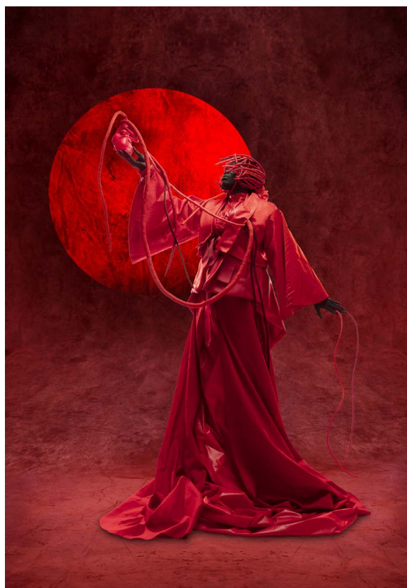
Mary Sibande, The Locus , 2019 Series I Came Apart at the Seams Inkjet on Hahnemuhle Photo Rag, Daisec Mount 200 × 136 cm

The violence rooted in the lives of these vulnerable populations has inspired the artist to reflect on different ways of channelling anger, resulting in an exhibition in the form of a vast sculptural and sound installation that occupies an entire floor of the Museum.