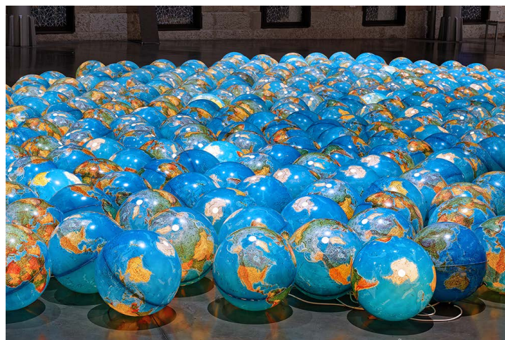
Ange Leccia, Arrangement , 1991 Collection macLYON Installation's view in UCLY, 2019 © Adagp, Paris, 2022 Photo Blaise Adilon

This initiative is part of the macLYON's cultural development projects with schools and third-level establishments, built around an innovative hands-on approach.