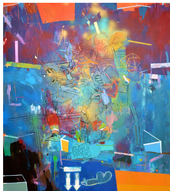
Thameur Mejri, States of Emergency 2 , 2020 200 x 180 cm

* Olivier Rachet, “Thameur Mejri, la peinture au poing”, Diptyk mag, 2021. 2 - Yves Brunner, “Thameur Mejri, un artiste pluriel “révolutionnaire” avant la révolution”, Lepetitjournal.com , 2012.