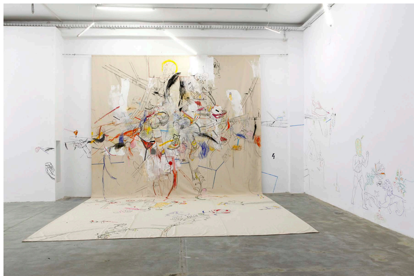
Exhibition's view: États d'exception , B7L9 Art Station, Kamel Lazaar Foundation, Tunis, Tunisia, 2021 Courtesy Kamel Lazaar Foundation, Geneva/Tunis Photo Firas Ben Khelifa

Courtesy of the artist and Selma Feriani Gallery, Tunis/London