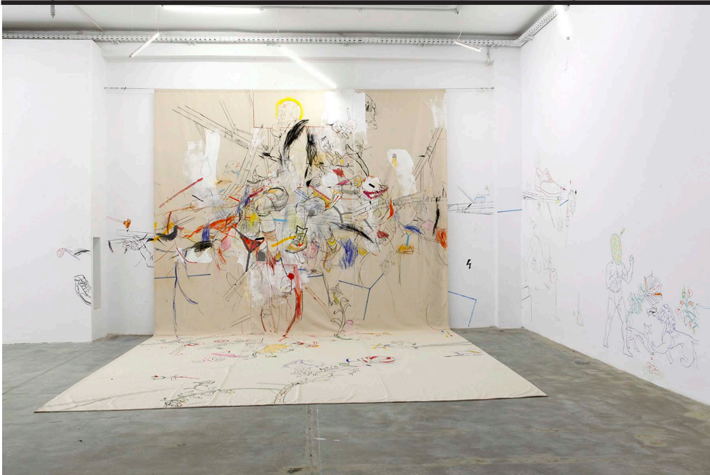
View of the exhibition States of Exception, B7L9 Art Station, Fondation Kamel Lazaar, Tunis, Tunisia, 2021. Courtesy Kamel Lazaar Foundation, Geneva/Tunis