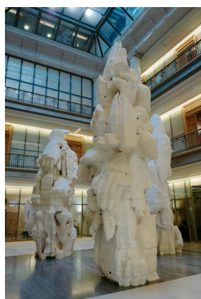
David Posth-Kohler, Sténos , 2019 macLYON Collection