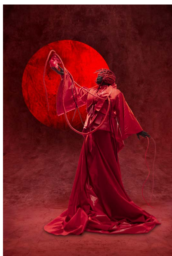
Mary Sibande, The Locus , 2019

Finally, the exhibition Little odyssee , which is primarily aimed at children, questions the role of art in the construction of the individual. It has been devised on the basis of works in the macLYON collection and in collaboration with the University of Lyon 3. An exhibition for young and old alike with a trail "at child height".