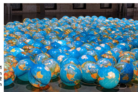
Ange Leccia, Arrangement , 1991 macLYON Collection © Adagp, Paris, 2022 Photo Blaise Adilon