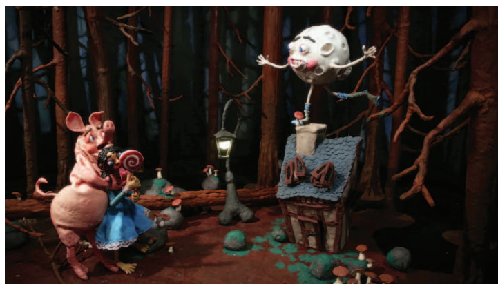
Nathalie Djurberg & Hans Berg, Dark Side of the Moon , 2017

Nathalie Djurberg shapes her little figures in clay and plasticine, then dresses them in fabrics and wigs and animates them in stop motion. Hans Berg, musician and composer, creates a hypnotic soundtrack that adds vitality and intensity to their films. Together, they create works that are allegorical and grotesque, chaotic and euphoric, comical and critical, featuring characters with exaggerated, sometimes tortured bodies, in conflict or in osmosis with other creatures – often animals or creatures inspired by tales. The transgressive narratives of their whimsical pieces are presented in all-encompassing settings in which moving images, sculptures and musical compositions are combined with astonishing stage sets.