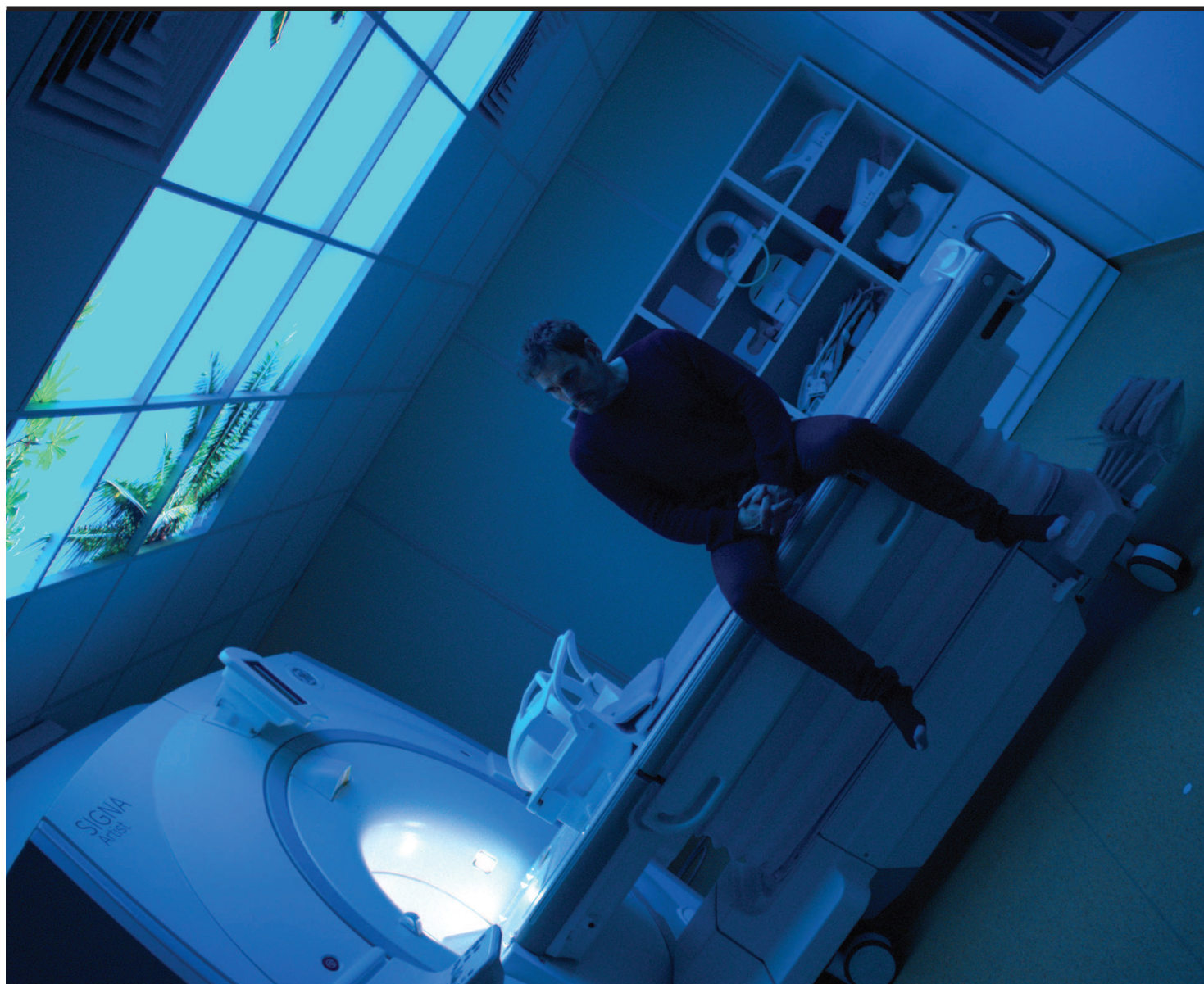
Jesper Just, production still, 2023