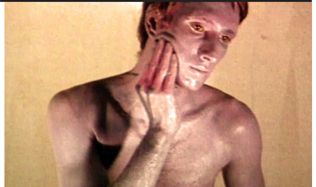
Bruce Nauman, Art Make-Up, 1967-1968 Collection macLYON