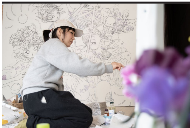
AYA TAKANO

AYA TAKANO is a prolific presence on the international art scene. She is a painter, illustrator, science fiction writer and manga artist. Over the years, she has created a rich and delicate universe that oscillates between eroticism and impertinence.