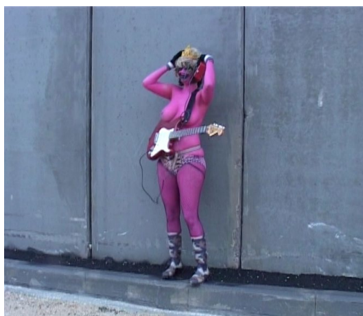
Tracey Rose San Pedro V (The Hope I Hope) , 2005 Collection macLYON