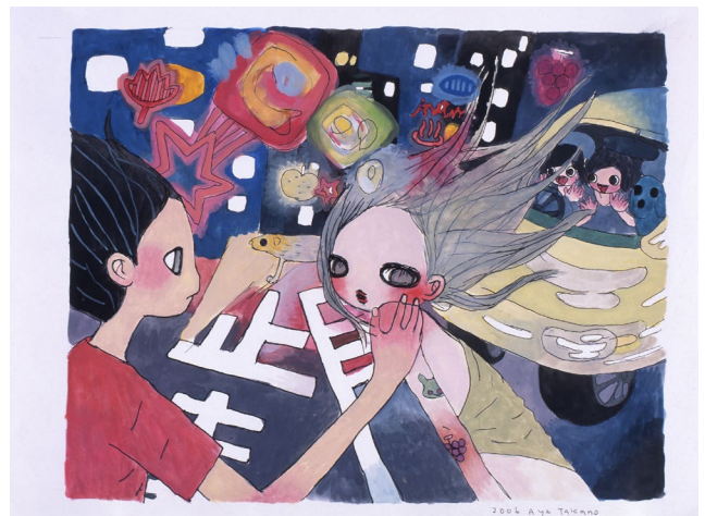
AYA TAKANO, Calendar of Love Vol. 37 , 2006 Ballpoint pen and watercolour on paper, 270 × 363 mm ©2006 AYA TAKANO/Kaikai Kiki Co., Ltd. All Rights Reserved.