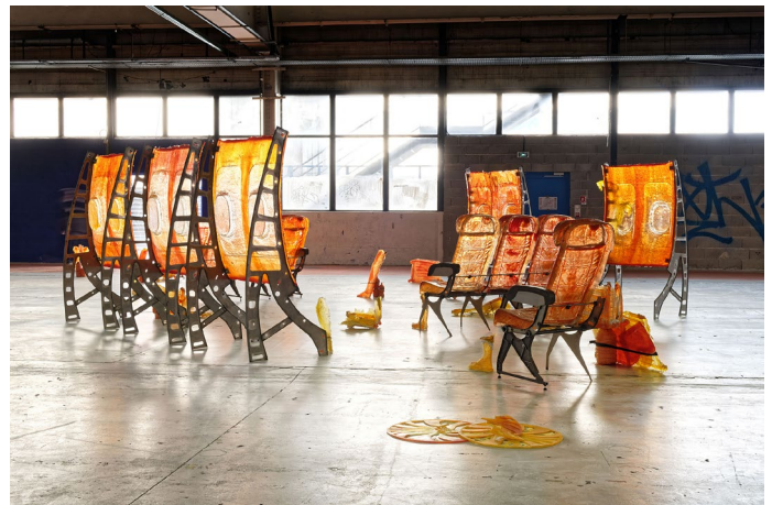
Rebecca Ackroyd, Singed Lids , 2019 Collection macLYON View of the Lyon Biennale 2019

The exhibition is completed by a set of new works that resonate with the exhibition Les formes de la ruine , at the Musée des Beaux-arts de Lyon from 1st December 2023 to 3rd March 2024.