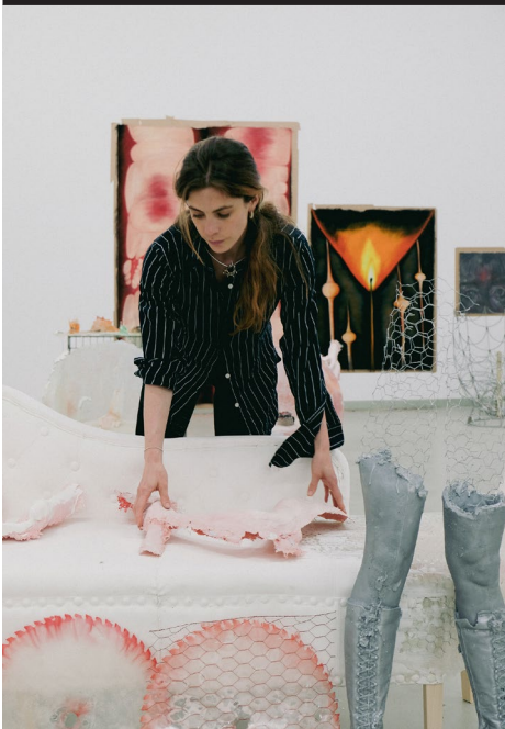
Rebecca Ackroyd Courtesy Projects, Berlin, and emergent magazine Photo Florentin Aisslinger