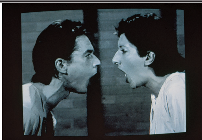
Marina Abramović & Ulay, AAA-AAA, 1978-1999 Collection macLYON