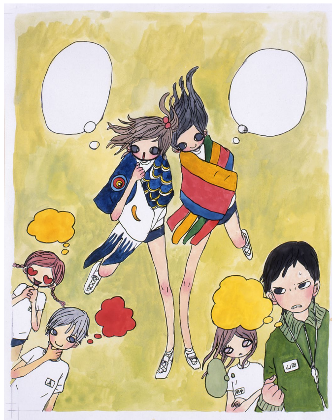
AYA TAKANO, Calendar of Love Vol.21 Episode : Run Away From Yamada I , 2005 Ballpoint pen and watercolour on paper, 334 x 262 mm ©2005 AYA TAKANO/Kaikai Kiki Co., Ltd. All Rights Reserved.

The notion of neo-animism and the idea that the world and reality go beyond what we are able to perceive are the main themes of this exhibition in which we are invited to go beyond the usual binary divisions and oppositions between natural and artificial, feminine and masculine, as well as logic and intuition.