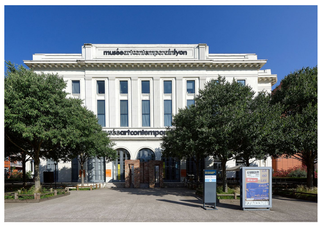
The Musée d'art contemporain de Lyon.

Brought together in an arts pole with the Musée des beauxarts since 2018, the two collections form a remarkable ensemble, both in France and in Europe.