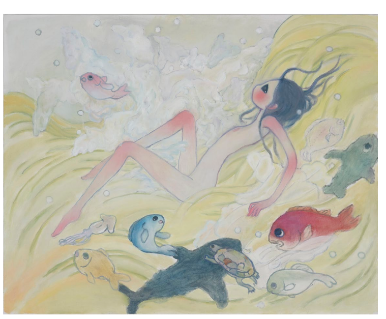
AYA TAKANO, Bitter-sweet-sour-tasting Primordial River in the Shape of All Things Glows and Cascades; Elation Begins, 2018 Oil on canvas, 727 × 910 mm ©2018 AYA TAKANO/Kaikai Kiki Co., Ltd. All Rights Reserved.