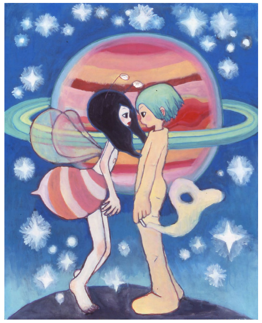
AYA TAKANO, Universe , 1998 Acrylic on canvas, 920 × 730 mm ©1998 AYA TAKANO/Kaikai Kiki Co.,Ltd. All Rights Reserved.

*Quote by the artist from the documentary AYA TAKANO – Towards Eternity, directed by Hélène Sevaux.