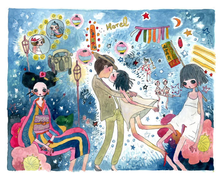
AYA TAKANO, Calendar of Love Vol. 57 In 1927, for Some Reason I Kissed the Girl Who Appeared Out of Thin Air., 2008 Ballpoint pen and watercolor on paper, 280 × 355 mm ©2008 AYA TAKANO/Kaikai Kiki Co., Ltd. All Rights Reserved. Courtesy Perrotin

The world of AYA TAKANO is unique. It is a fluid world in which references to ancient traditions blend with her own personal myths, which draw on science fiction, animated cartoons, dreams and her imagination. The artist has also worked extensively with fashion designers and jewellery, as well as cosmetic houses. Some of these objects, which reflect the rich variety of AYA TAKANO's practice, will be found among her works in the exhibition.