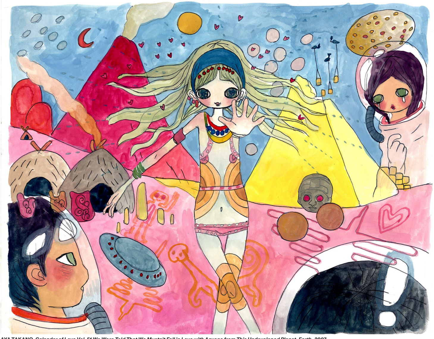
AYA TAKANO, Calendar of Love Vol. 51 We Were Told That We Mustn't Fall in Love with Anyone from This Undeveloped Planet, Earth., 2007 Ballpoint pen and watercolor on paper, 297 × 320 mm

With the support of the Japan Foundation