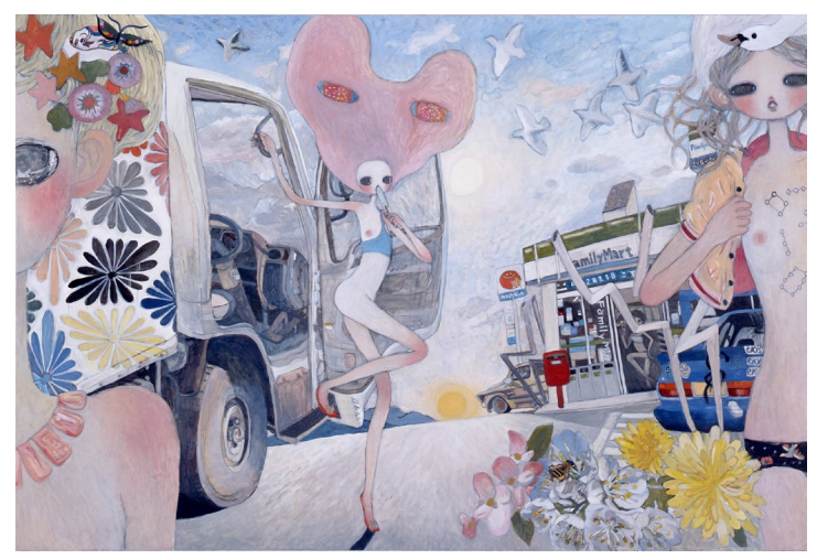
AYA TAKANO, Alighting on the Land of Convenience Store, 2014 Oil on canvas, 1303 × 1942 mm ©2014 AYA TAKANO/Kaikai Kiki Co., Ltd. All Rights Reserved.