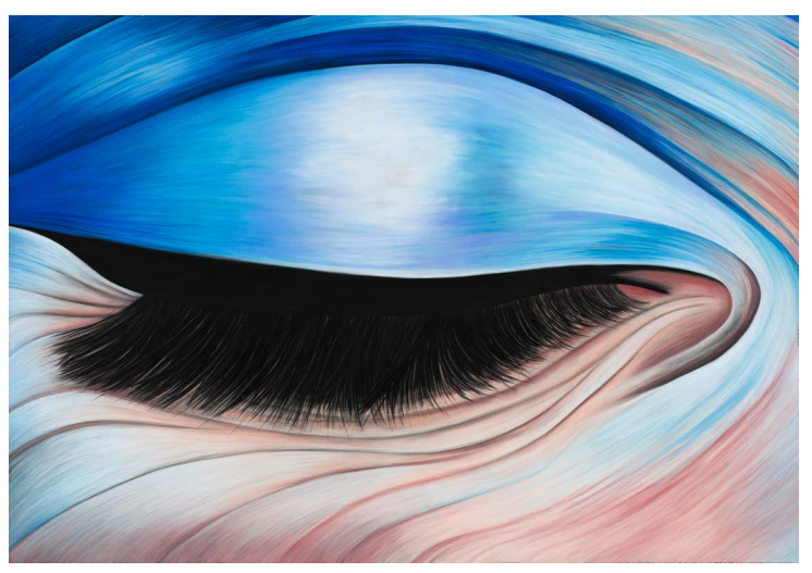
Rebecca Ackroyd, Evening Star , 2023 Gouache, soft pastel on Somerset satin paper - 145 × 184