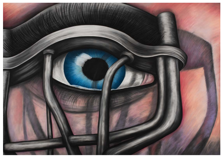
Rebecca Ackroyd, Dusk , 2023 Gouache, soft pastel on Somerset satin paper - 145 × 184 cm

The entire Shutter Speed exhibition reveals the diversity of media used by Rebecca Ackroyd (resin, pastel...) as well as her interest in the fragmentation of the body and temporality.