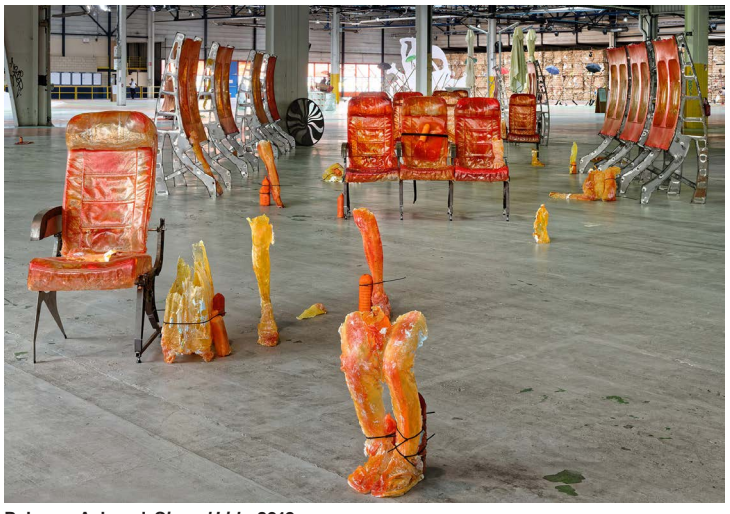
Rebecca Ackroyd, Singed Lids , 2019 Collection macLYON, View of the Lyon Biennale 2019 Courtesy of the artist and Peres Projects, Berlin Photo Blaise Adilon

By calling the exhibition Shutter Speed , Rebecca Ackroyd not only refers to a fraction of time, but also conjures up the photographic lens and the exposure time that enables light to capture an image. Here, she does not so much wish to imitate an actual camera as to evoke the rapid and fragile moment when light freezes reality.