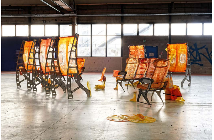
Rebecca Ackroyd, Singed Lids , 2019 Collection macLYON, View of the Lyon Biennale 2019

Her works are mainly sculptures and drawings : "I'm interested in how the two processes differ – it's possible for drawing to be free in a way that sculpture isn't, as it requires more working out – it's always the freedom i'm after." From #legend magazine - Rebecca Ackroyd in conversation with Stephenie Gee, 2022.