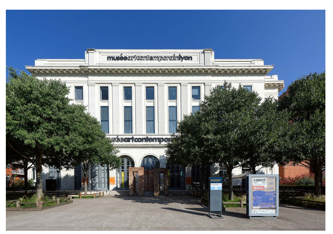
The Musée d'art contemporain de Lyon.

Brought together in an arts pole with the MBA since 2018, the two collections form a remarkable ensemble, both in France and in Europe.