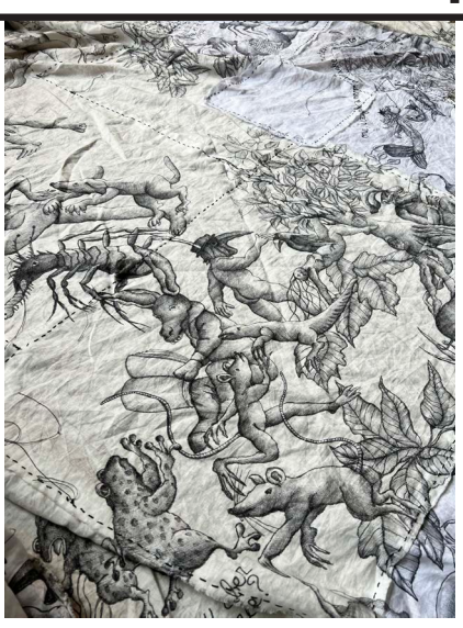
Endless Drawing in progress in Sylvie Selig's studio Photo macLYON