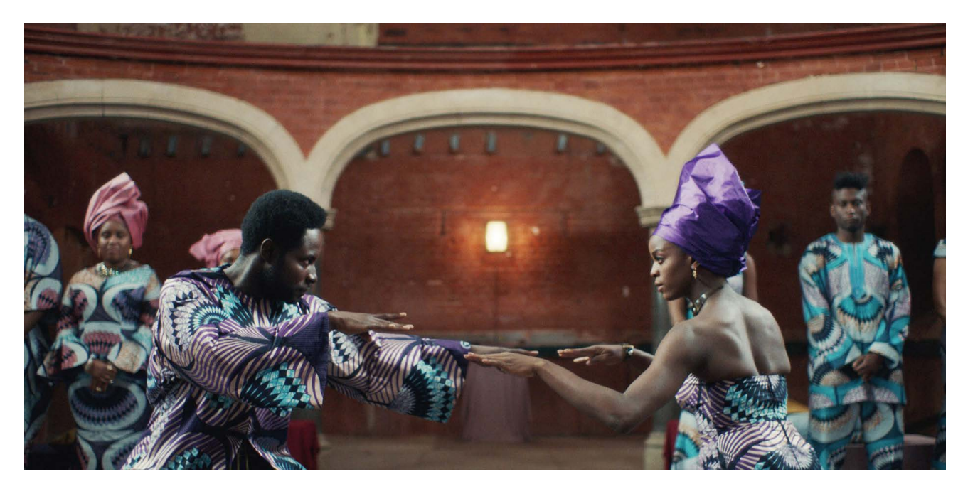
Hetain Patel, Don't Look at the Finger, 2017 Coloured video, sound Duration: 16'09' British Council Collection

Supported by the British Council. Presented as part of Spotlight on Culture UK/France 2024 - Together We Imagine.