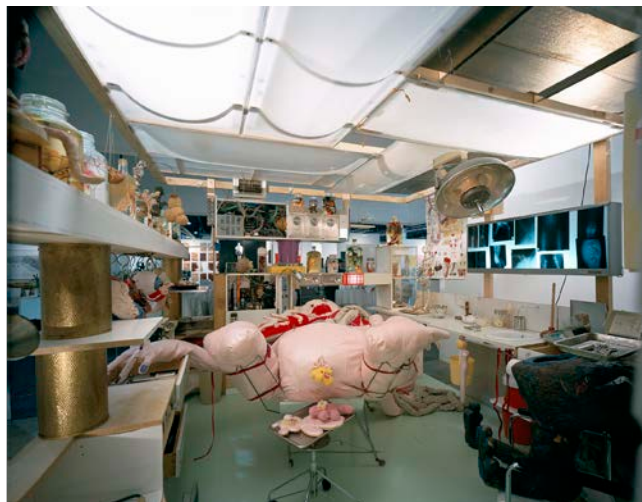
Gelitin, Operation Rose , 2004 Collection Antoine de Galbert, Paris

Whether pungent or viscous, their performances and installations are genuine experiments in which the public are invited to indulge their curiosity. In the strange room of Operation Rose , a monstrous creature is giving birth amidst surgical instruments, anatomical drawings and pieces of stuffed toys preserved in jars of formaldehyde. A recurring theme in their practice, the coloured entrails of an imaginary animal and all the disturbing matter with which they are associated are on display for all to see.