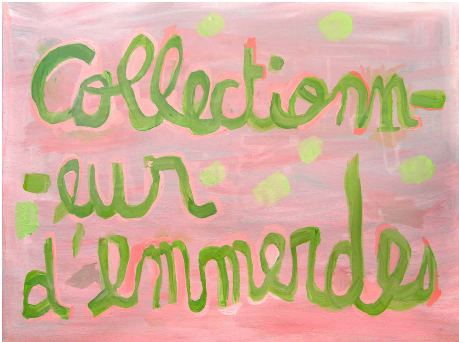
Thibault de Gialluly, Collectionneur d'emmerdes , 2016 Collection Antoine de Galbert, Paris