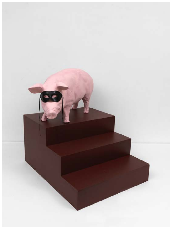
Arnaud Labelle-Rojoux, Loup de rigueur , 2020 Collection Antoine de Galbert, Paris