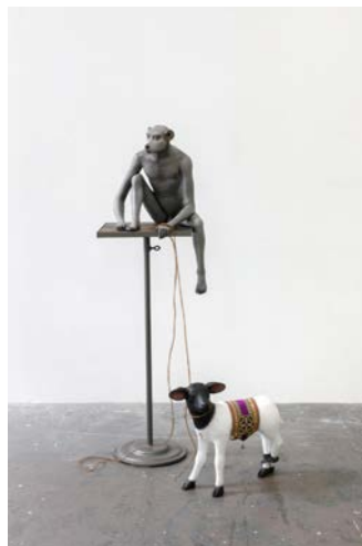
Jane Alexander, Custodian and Hobbled Lamb, 2021 ( Custodian, 2005 ; Hobbled Lamb, 2014) Collection Antoine de Galbert, Paris

Born in Johannesburg in 1959, Jane Alexander is one of the most celebrated figures in contemporary South African art. Her sculptures, installations, paintings and photomontages are inspired by the experience of apartheid, a socio-political context whose violence they reflect. The work that made her name, The Butcher Boys , consists of three life-size, naked anthropomorphic figures whose faces blend human and non-human characteristics. At once abject, disturbing and vulnerable, these anonymised figures evoke torture, the abuse of power, and the dehumanising aspects of this chapter of history. Custodian and Hobbled Lamb are among the many figures, sometimes described as 'human-animals', that the artist has since assembled in disturbing installations.