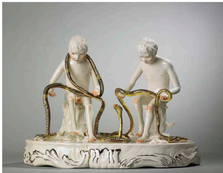
Shary Boyle, King Cobra , 2010 Collection Antoine de Galbert, Paris