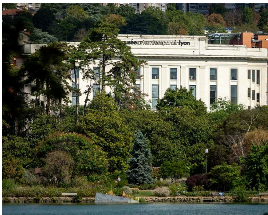
View of the Musée d'art contemporain de Lyon

Brought together in an arts pole with the Musée des beaux-arts since 2018, the two collections form a remarkable ensemble, both in France and in Europe.