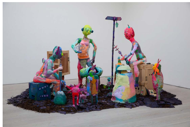
Luke Routledge, The Apple, the Egg & the Butterfly , Studio Response 2, 2022 Mixed media Variable dimensions

Luke Routledge's works takes the form of human-scale figurative sculptures that are framed as the inhabitants of a speculative, fictional multiverse. The sculptures are installed to create open-ended narrative structures, and the works employ animatronic components to elicit audience participation, bringing the works to life. Echoing Fabien Verschaere's 60 drawings for Seven Days Hotel , a major work in the macLYON collection, Luke Routledge presents a series of sculptures evoking imagination and friendship.