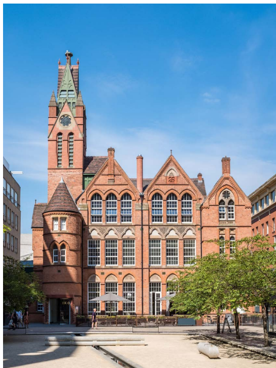
View of the Ikon Gallery