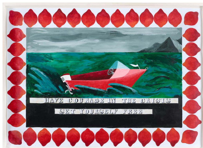
Lubaina Himid, Have Courage in the Crisis, Set Yourself Free , 2016 Acrylic on paper 102 x 72 cm British Council Collection