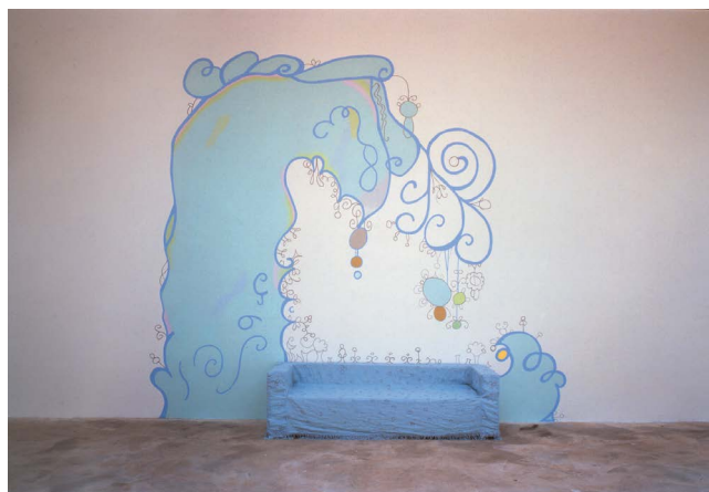
Lily van der Stokker, Nice and Easy , 2002 Installation, wall painting and sofa covered with an embroidered slipcover, acrylic paint, synthetic foam, fabric and medium 375 x 426 x 79 cm Deposit by the CNAP at the Musée d'art contemporain de Lyon since 6 October, 2004