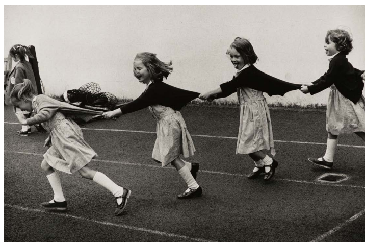
Markéta Luskáčová, Children in Playground IV, London , 1988 Silver print 40 x 50,5 cm British Council Collection