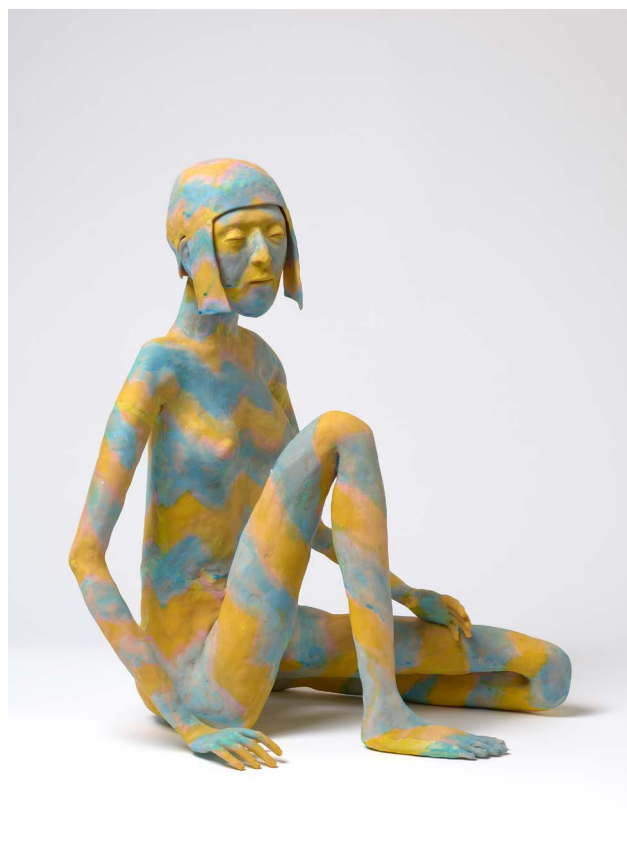
Francis Upritchard, Marianne , 2016 Steel and foil armature, paint, modelling material, paper mache 55 × 38 × 47 cm British Council Collection

Supported by the British Council. Presented as part of UK/France Spotlight on Culture 2024 Together We Imagine .