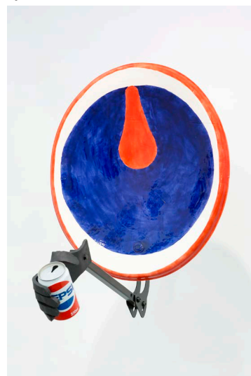
Emma Hart, Pepsi and Shirley , 2017 Glazed ceramic, steel 53 x 69 x 104 cm British Council Collection Photo: Renato Ghiazza Courtesy of the artist and The Sunday Painter