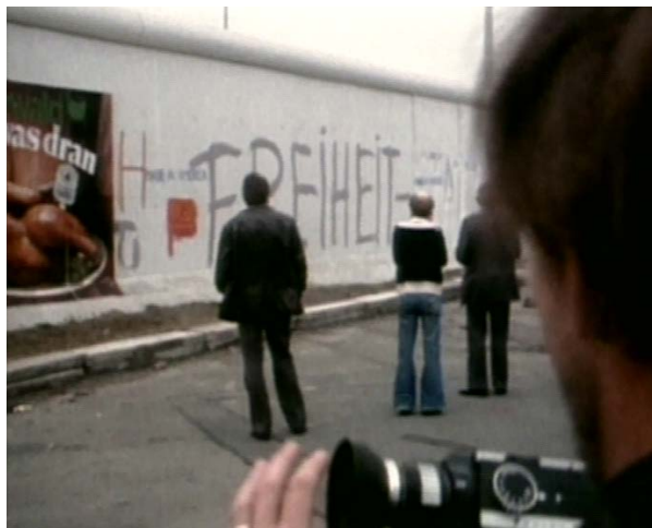
Gordon Matta-Clark, The Wall, 1976-2007 Coloured video, sound Duration: 15'04" macLYON collection - Inv.: 2008.2.3.14