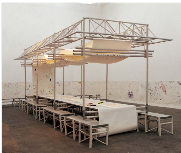
Niek van de Steeg, Structure de correction, table de débat , circa 2000 View of the exhibition Structure de correction – Toc mural de Niek van de Steeg et Géraldine Pastor Lloret , Crac Occitanie, 2004 Installation - 300 × 280 × 960 cm Collection of the artist Deposit by the artist at the Musée d'art contemporain de Lyon since 8 June, 2009