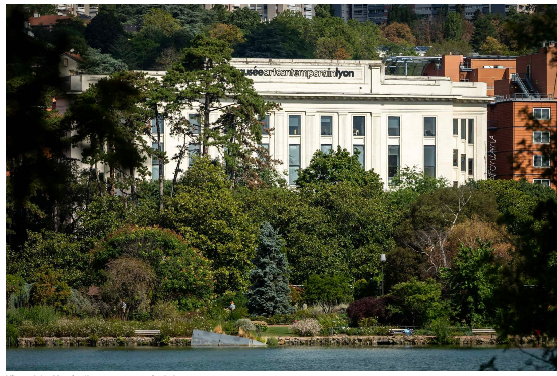
View of the Musée d'art contemporain de Lyon

Brought together in an arts pole with the Musée des beauxarts since 2018, the two collections form a remarkable ensemble, both in France and in Europe.