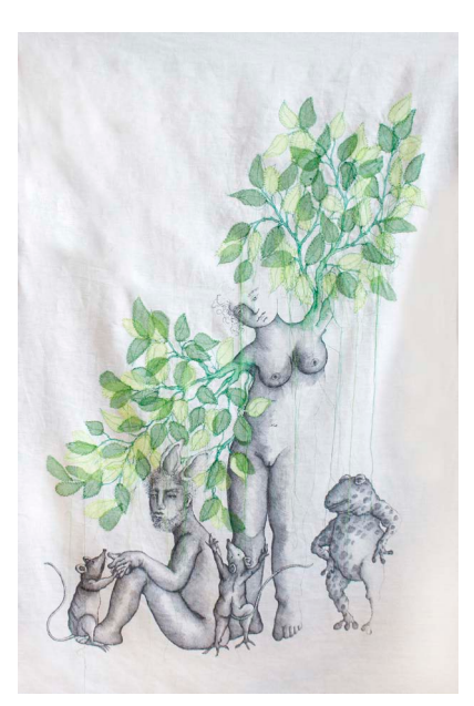
Sylvie Selig, Daphné , 2023

In addition to the huge canvases, there are numerous drawings on textiles, both new and recycled (old tablecloths, shirts, sheets, etc.). They are drawn with felt-tip pens or ink and in various formats. They also feature a grotesque and fantastic bestiary evoking the terrors of childhood, as well as the haunting fantasies of Lewis Carroll. The artist embroiders over these motifs, overstitching and completing them with red, green, white and black thread. She reinforces some of the shapes, creates new ones and blends words with the images.