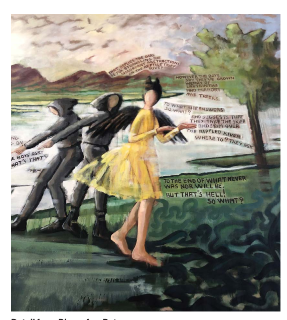
Detail from River of no Return