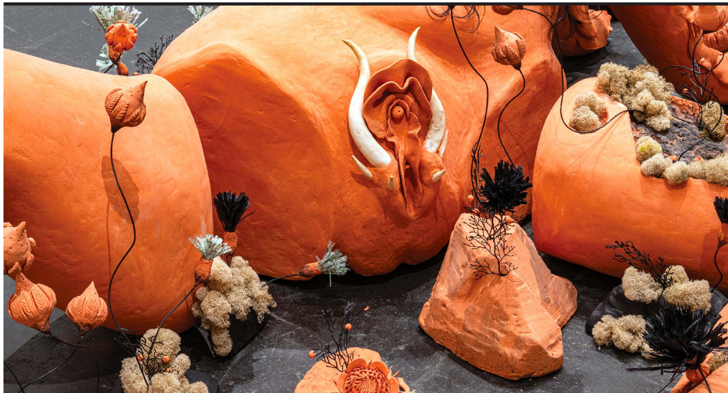
Rajni Perera & Marigold Santos, Efflorescence/The Way We Wake (detail), 2023

Polymer clay, styrofoam, paint, metal powder, synthetic hair, beads, steel, aluminium, florist's foam, paper, plastic, 152,4 x 243,8 x 121,9 cm