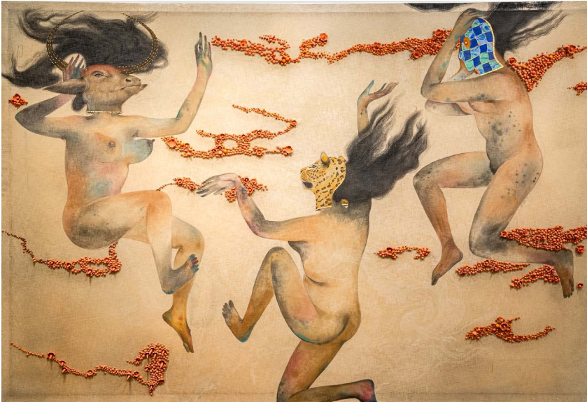
Rajni Perera, I Couldn't Wait Longer , 2023

Polyester, acrylic gouache, chalk, charcoal, gel pen, gold metallic thread, polymer clay beads, glass beads, wooden beads, aluminium and wooden frame, 243,8 x 365,8 cm