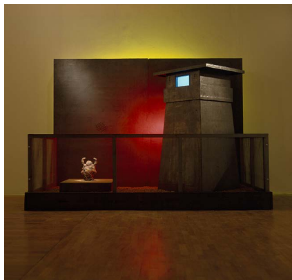
Terry Allen, Youth in Asia , 1983