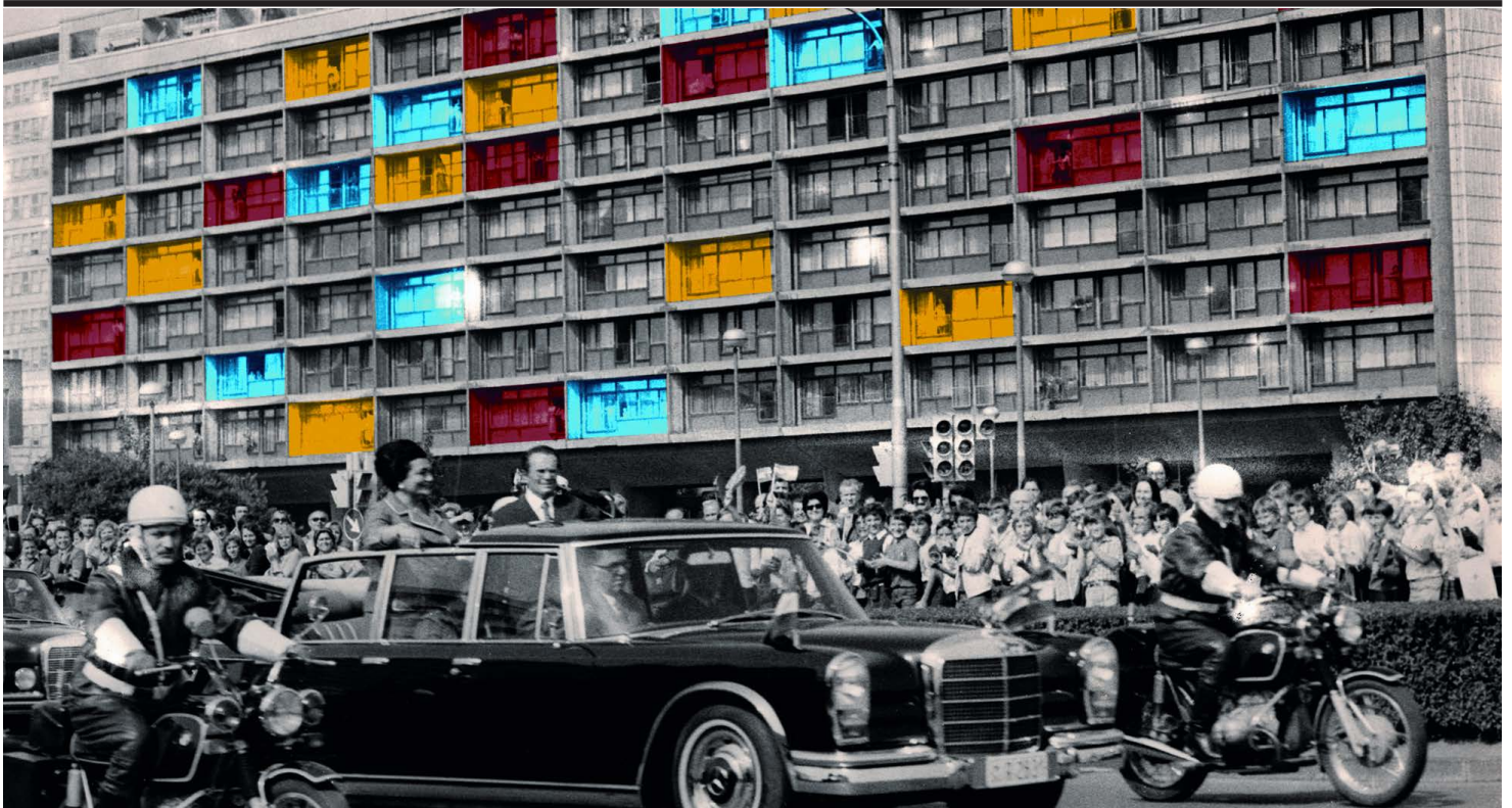
Sanja Iveković, NOVI ZAGREB (People at the Windows) , 1979 Photocollage, digital printing, 127 x 174 cm. MoCAB Collection