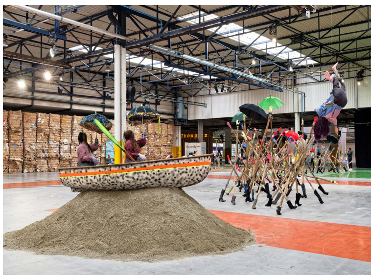
Simphiwe Ndzube, Journey to Asazi (detail), 2019

Produced for the Biennale 2019. macLYON collection.