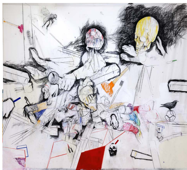
Thameur Mejri, Hope 2 , 2022

Produced for the Biennale 2019. macLYON collection.