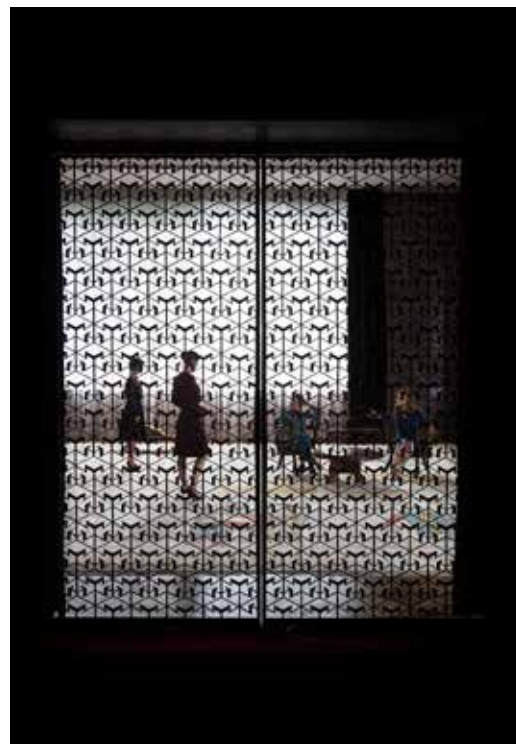
Jasmina Cibic, Tear Down and Rebuild, 2015

Single channel HD video, stereo, 15min 28sec, production still