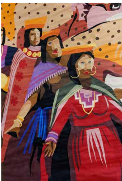
JAZ, Rito de Iniciación (Como Latinoamérica le da la bienvenida a sus nuevas dictaduras), (détail), 2016

Produced for the Wall Drawings exhibition at macLYON, 2016