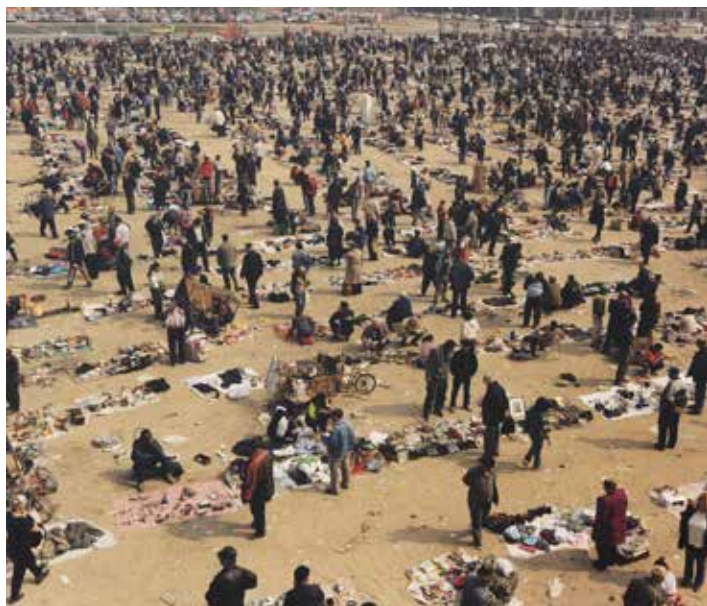
Milan Aleksić, Flee market, Belgrade, Serbia, 1997 Colour photograph, 122 × 106 cm Collection of Museum of Contemporary Art, Belgrade