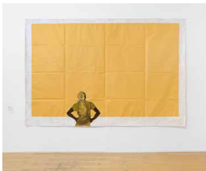
Maxwell Alexandre, Untitled de la série New Power, 2019