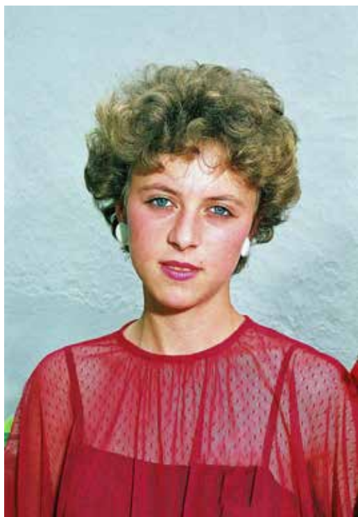
Dragan Petrović, Portrait of a girl with blue eyes.

Oil on canvas, 200 × 200 cm Collection of Museum of Contemporary Art, Belgrade. © Adagp, Paris, 2025