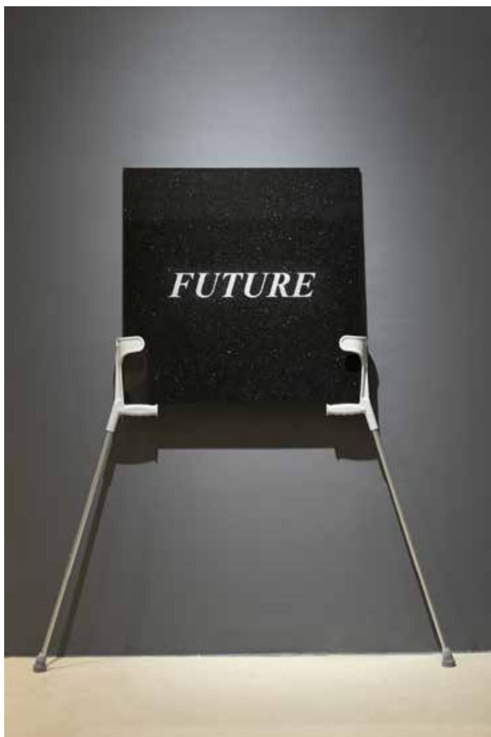
Mladen Miljanović, Future, 2017 Installation, crutches, granite slab, 80 × 120 × 10 cm Collection of Museum of Contemporary Art, Belgrade.

The tension between the aesthetic and the political dimension of a work of art is a key issue for artists who are politically and socially engaged. A work of art can be political and still retain an aesthetic stance: it does not exist simply to convey a message, but rather articulates that message through form, sensitivity and a particular artistic language. Political works thus intersect with aesthetic questions and certain social concerns to reveal the fractures, oppressions and conflicts that run through our societies. The political dimension of art, as it is presented here, cannot be reduced to militant discourse. It raises questions about the collective nature of societies, power structures, and also about wars, which epitomise those deep tensions which leave scars that mark entire peoples for generations. Nevertheless, some works manage to sublimate these dramas, representing them in powerful allegorical forms, developing historical narratives, critical metaphors or utopian visions. They thus become spaces of resistance, harbingers of hope for a common, yet-to-be-invented future.