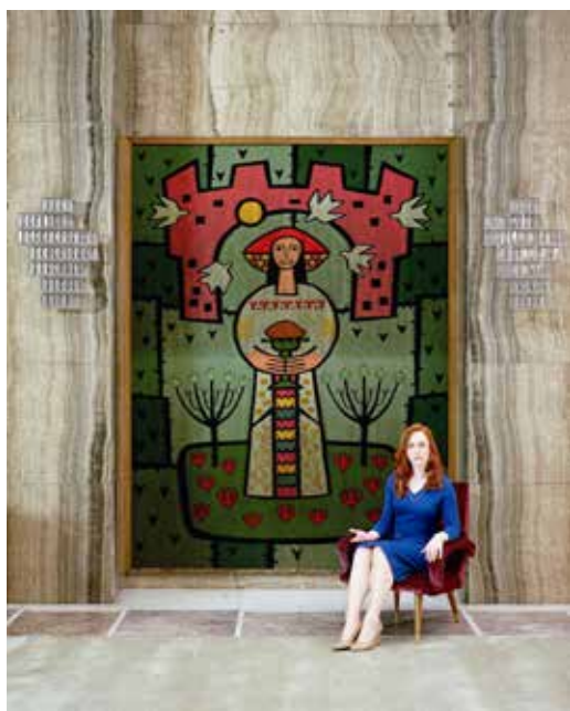
Jasmina Cibic, Tear Down and Rebuild , 2015

Single channel HD video, stereo, 15min 28sec, production still Collection of Museum of Contemporary Art, Belgrade