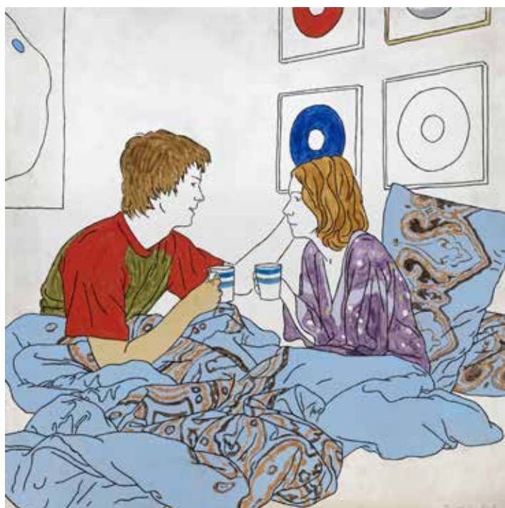
Žolt Kovač, Coffee in Bed , 2008. Oil on aluminium, 100 × 100 cm

The collections of both museums feature works that explore relationships: what connects us to others, to our communities and to our shared heritage. This chapter begins with physical contact, seen both as a source of tension and a means of communication between bodies, in spaces governed by social rules and codified gestures. The body becomes an interface, involved in symbolic or economic transactions; it reflects the hierarchies and norms that operate in our everyday environments. The works on display also explore the construct of collective identity, its role in power dynamics, and the mechanisms of inclusion or exclusion that such an identity brings about. The artists explore various forms of community organisation and bonds of solidarity, as well as the tensions and power relationships entrenched in our history and social structures, in order to expose the often invisible mechanisms – economic relations, symbolic boundaries and cultural stereotypes – that govern our interactions.