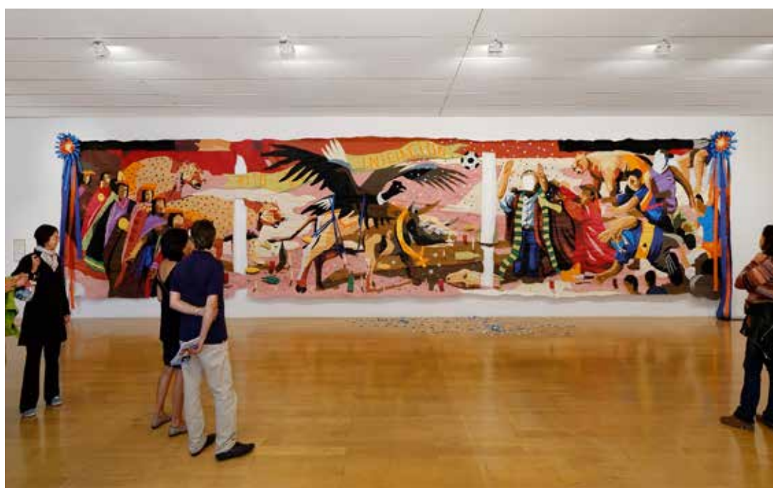
JAZ, Rito de Iniciación (Como Latinoamérica le da la bienvenida a sus nuevas dictaduras) , 2016

Produced for the Wall Drawings exhibition at macLYON 2016