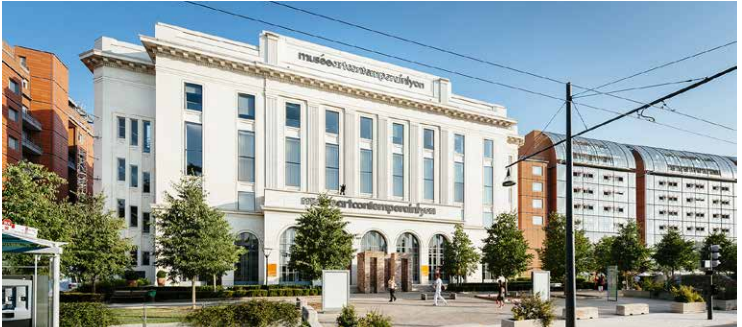
View of the Musée d'art contemporain de Lyon.

Established in 1984 in a wing of the Palais Saint-Pierre, in 1995 the Musée d'art contemporain de Lyon moved to the site of the Cité internationale, a vast architectural ensemble spread over one kilometre on the edges of the Parc de la Tête d'Or, in Lyon's 6 th arrondissement. Entrusted to the architect Renzo Piano, who designed the entire site, the museum conserves the facade of the atrium of the Palais de la Foire, designed by Charles Meysson in the 1920s, on the park side.