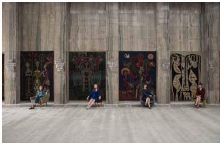
Jasmina Cibic, Tear Down and Rebuild , 2015

Single channel HD video, stereo, 15min 28s, production still