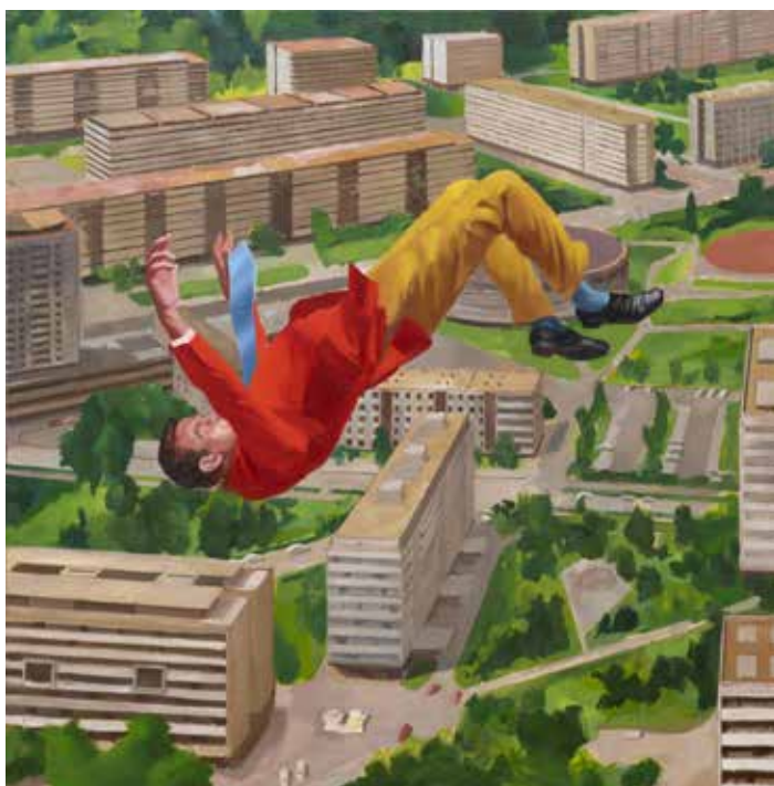
Mihael Milunović, Fallers 1 , 2023

Single channel HD video, stereo, 15min 28sec, production still Collection of Museum of Contemporary Art, Belgrade