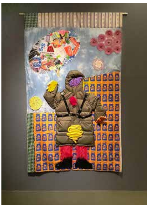
Randolpho Lamonier, Foolish boy , 2024

Collection of Museum of Contemporary Art, Belgrade