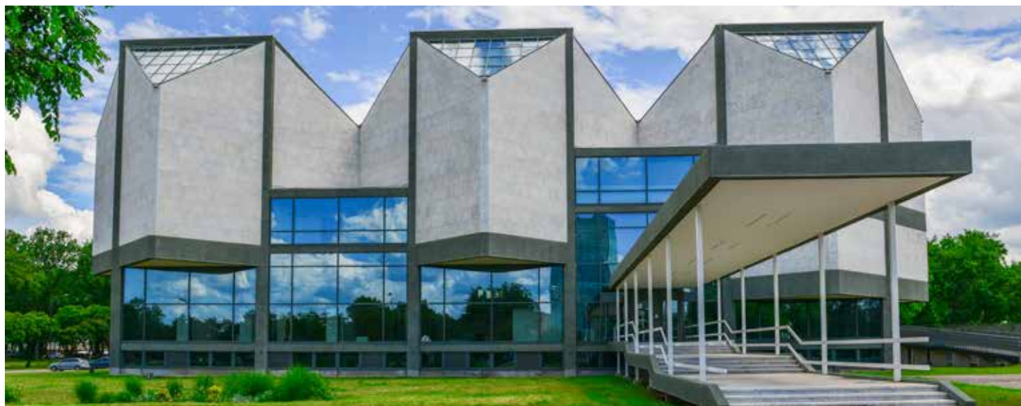
Facade of the MoCAB.

The Museum of Contemporary Art (MSUB/MoCAB) in Belgrade, Serbia, is an important institution dedicated to modern and contemporary art. Its history reflects the cultural aspirations and challenges of the region. The museum was founded in 1958 by the People's Committee of the City of Belgrade, who set up the Modern Gallery, to oversee and promote the development of contemporary art in Yugoslavia. In the early 1960s, a competition was held to build a museum in line with modern museological standards. The site selected was in New Belgrade (one of the ten municipalities of the city of Belgrade), at the confluence of the River Sava and the Danube. The building was designed by architects Ivan Antić and Ivanka Raspopović. It has a striking polymorphous crystal form composed of six angled cubes. It has five interconnected exhibition levels within its interior, which ensure a smooth and uninterrupted spatial experience.