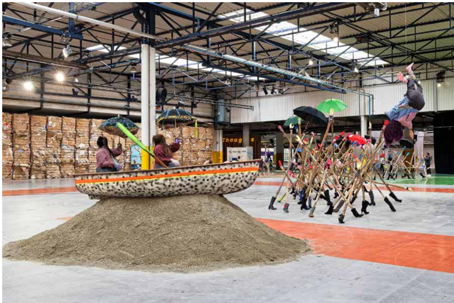
Simphiwe Ndzube, Journey to Asazi (détail) , 2019

The main idea behind this collaboration and exchange between the collections is to provide as much insight as possible into the museums' acquisition policies, their areas of interest, how they shape the collections and how, over time, they resonate with developments on the local and international art scenes, as well as with social and political changes.