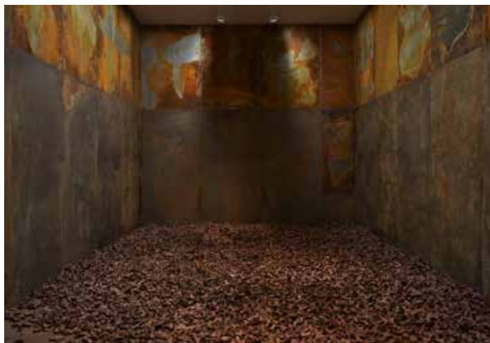
Chiffon Thomas, Untitled (tomb) , 2024

Art © Terry Allen / Adagg, Paris, 2025 - Photo : Blaise Adilon