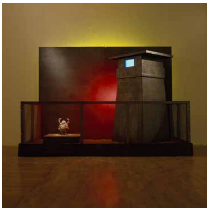
Terry Allen, Youth in Asia , 1983

Courtesy of the artist. macLYON Collection. Photo : Blaise Adilon