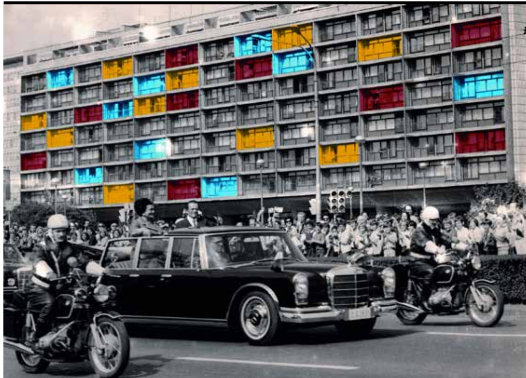
Sanja Iveković, NOVI ZAGREB (People at the Windows) , 1979

Photo collage, digital printing, 127 × 174 cm. Collection of Museum of Contemporary Art, Belgrade.