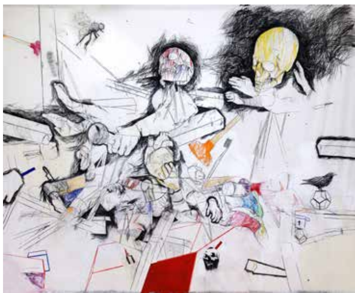
Thameur Mejri, Hope 2 (Espoir 2) , 2022

Collection of Museum of Contemporary Art, Belgrade.