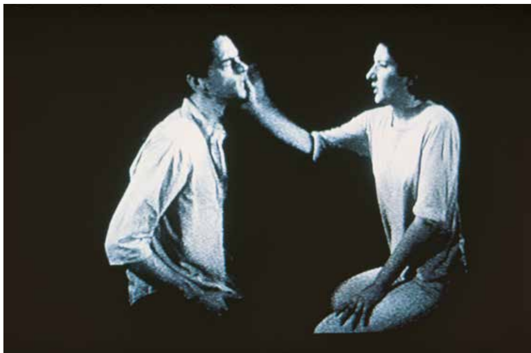
Marina Abramovic & Ulay, Light/Dark, 1977-1999